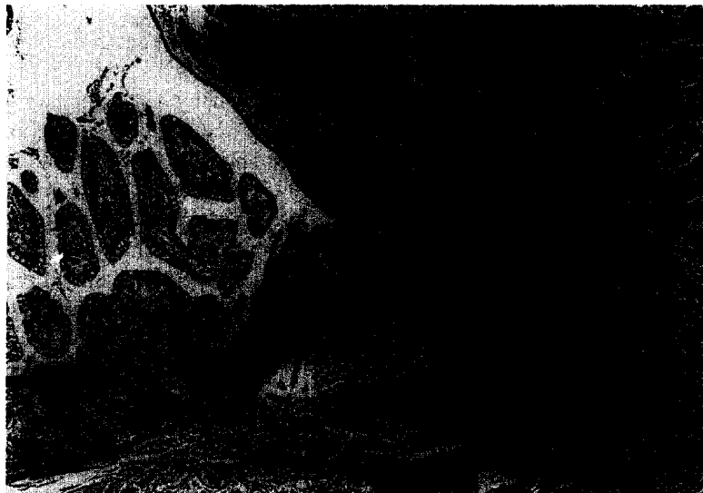
Fig. 2. Section through mucosa and submucosa of the colon. Carcinoid tumour (short arrow), normal mucosa (long arrow). Haematoxylin-eosin; original magnification \times 25 .

Routine laboratory results showed no abnormalities. Serum calcium amounted to 2.40 mmol/l, albumen 46 g/l and PTH(1–84) 14.9 ng/l (N). Urinary 5-HIAA excretion varied between 28.2 and 36.6 \mu\text{mol}/24\text{ h} ; incidentally a value of 50.9 \mu\text{mol}/24\text{ h}