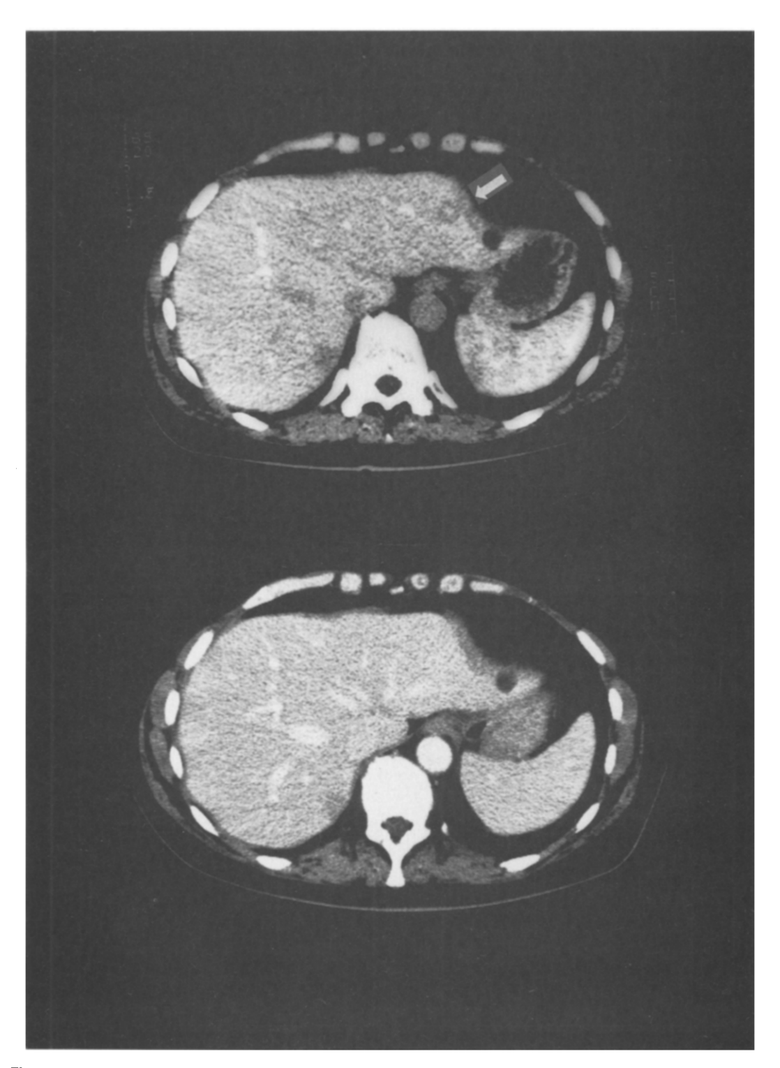
Fig. 1. Conventional CT (lower) and CCTA (upper) scans of same patient. CCTA revealed additional lesion in segment 2 (arrow). This was correctly interpreted as metastasis.

tient). A total of 27 women and 33 men were evaluated; 27 patients were treated for primary colon cancer or local recurrence of a previously treated colorectal carcinoma, and 33 patients underwent operation for isolated liver metastases, 32 for elective resection and one for se-