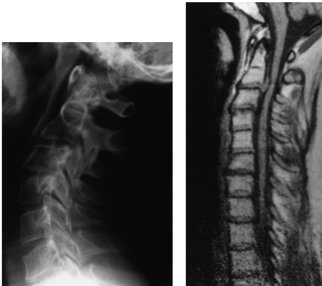
Figure 1 Case 1: (a) A lateral radiograph of the cervical spine showing disc space narrowing which is suggestive of degenerated intervertebral discs. There is a posterior osteophyte at the C 3-4 level. (b) A magnetic resonance image of the cervical spine (T 1 -weighted sagittal image). There are narrow intervertebral discs at all levels, and a herniated disc at the C 2-3 level with compression of the spinal cord.

dysfunction, and that they are not familiar with this kind of pathology in patients with DS. The mean delay in diagnosis in the five patients in the present study was 3 years. If cervical myelopathy is diagnosed too late, neurosurgical intervention often can not prevent further deterioration (Murali & Masdeu 1997). The diagnostic delay in the present sample may explain the poor results after neurosurgical intervention.