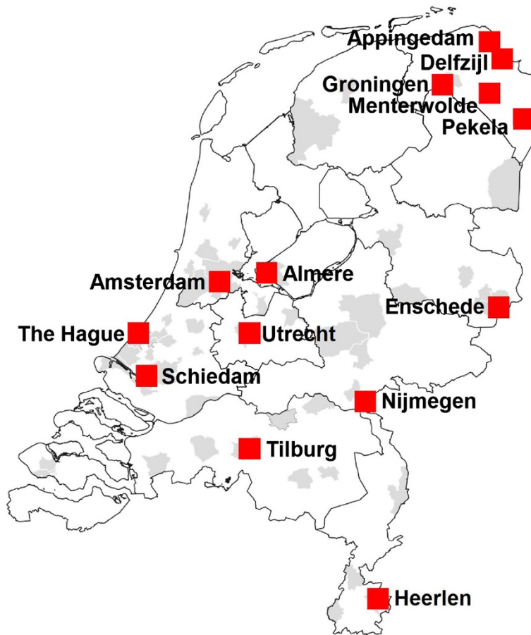
Figure 3 Participating municipalities in the 'Healthy Pregnancy 4 All' project.

services. Organisation and logistics regarding out roll of the two sub studies is presented in the specific design papers.