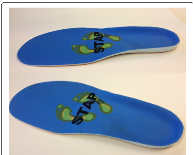
Fig. 2 The placebo insole

All patients referred to a podiatrist will have a second appointment within 2 weeks after the intake, of approximately 10 min to pick up their insole. Patients randomized to the custom made insole group will receive a custom made insole. Patients randomized to the placebo insole group will receive a placebo insole (Fig. 2), that has been custom designed for their foot (based on a 3D imprint of their foot) without providing therapeutic effect, but still have the visual effect of a podiatric insole. See Fig. 3 for the standardized production procedure of the placebo insole. All placebo insoles will be produced by the same podiatrist according to this protocol after receiving the 3D imprint from the different podiatrists. The placebo insoles will then be sent back to the different podiatrists to give to the patients. The custom made insole will always be patient tailored, but will be produced according to usual podiatric care by the different podiatrists. A third checkup appointment will be offered to the patients in the placebo insole group and the custom made insole group after 12 weeks as part of the usual podiatric care. Podiatrists with a practice near participating GP's and sports physicians were approached to participate in the study. For every