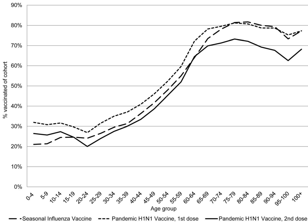
Figure 1. Vaccination coverage per age group. Vaccination coverage per age group for seasonal influenza vaccination and first and second doses of influenza A(H1N1)pdm09 vaccine in the cohort of patients that had an indication for pandemic influenza vaccination. doi:10.1371/journal.pone.0063156.g001