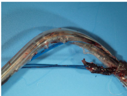
Fig. 2 Segment of the lead showing 4 externalised conductors which had abraded the outer insulation

A large retrospective study in more than 15 thousand patients implanted with Riata 1580 and 7000 series combined showed