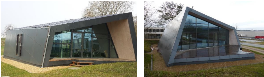
Figure 1 – South façade (left) and North façade (right) of Fold

Figure 1 shows the exterior views of the actual house.