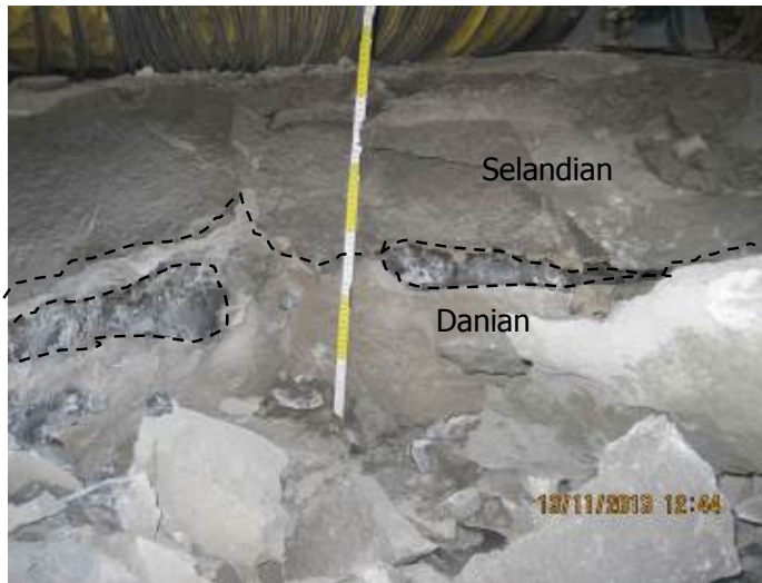
Fig. 3 The boundary between Selandian Greensand limestone and Danian Upper Copenhagen Limestone. Flint nodules observed just below the boundary. The nodules are infilled burrows.

As mentioned earlier, Sbv is located in the reference area for the Paleocene Greensand Formation. At Sbv around 4 m of fossil-rich, only slightly lithified Greensand was observed below the Quaternary clay till and above the Greensand conglomerate. The Greensand conglomerate below the Greensand constitutes the boundary to the Upper Copenhagen Limestone. The boundary is well defined with a shift in colour from dark greenish grey to light grey. Just below the boundary horizontal burrows infilled with flint are observed. The top of Upper Copenhagen Limestone has been observed in 7 face log profiles, from level -7.9 to -9.3 m. The boundary between UCL and MCL was recorded in 2 profiles; at level -22.0 to -22.3 m. MCL was recorded from this level to bottom of excavation around level -32 m. The face logged limestone is dominated by induration H2 and H3, both in Upper and Middle Copenhagen Limestone.