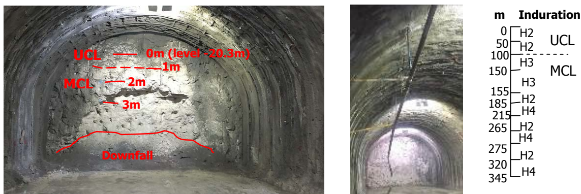
Fig. 4 Face logged cavern wall, Track 1. The face was logged every 3 m. A lift was used for the face logging. The holes in face are due to hammering. Note shotcreted ceiling. Indurations from logged face shown to the right.