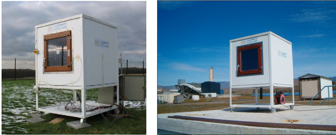
Figure 1. Test box during winter at the measuring site at BBRI, Belgium (left) and during summer at the Plataforma Solar de Almeria, Spain (right).

other hand is dry and extremely hot in summer, with large temperature amplitudes between day and night. During day time, solar radiation is very high on horizontal surfaces and the sky is usually very clear. Figure 1 shows the test box at both sites.