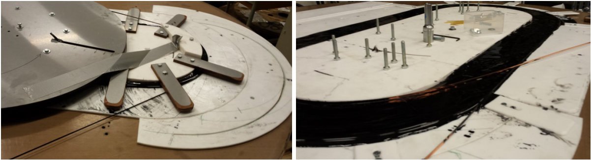
Fig. 2. Winding table during winding of the first layer (left) and second layer (right) of a double pan-cake \text{MgB}_2 coil.