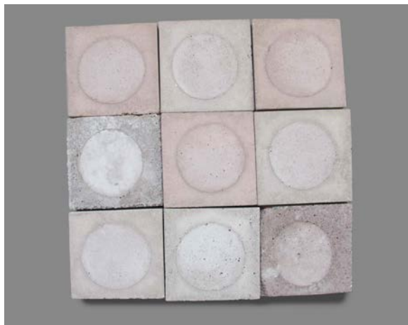
Fig. 5. Accentuation of colour displayed by the difference of rough and smooth surfaces. The circular parts are smooth and the surrounding areas are rough.

However, the experiments also showed that the use of paper as form materials can cause technical challenges. In some cases the paper attached to the surface of the hardened mortar and it was not possible to remove it Fig. 6. Only by using a brush and running water did the paper detach. Consequently, the samples lost some of their vibrancy because the textural differences were blurred by this treatment. The reason why the lining paper sometimes was stuck to the surface was not identified and will need to be investigated further. Despite the fact that these form materials showed constrains in usage, the experiments exhibited a general idea of using absorbent and water repellent form materials combined to accentuate the colours of cement based materials which in this case was SSA-containing mortar.