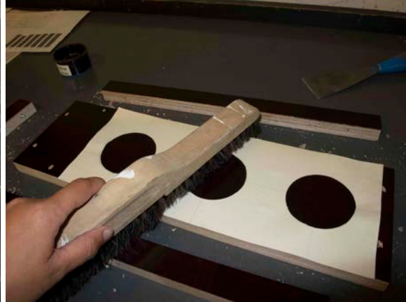
Fig. 2. The wet paper glued to the base.