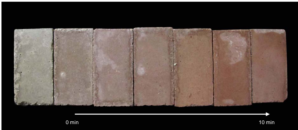
Fig. 3. Colour scale of moisturized mortar samples. The Grey colour of normal mortar gradually changes as the fineness of SSA particles increases. The first mortar sample to the left does not contain any SSA. The second sample contains un-treated SSA. Hereafter, the samples contain ground SSA of increasing fineness.

The experiments of this study revealed that the colour of the SSA-containing mortar intensified as the time interval of the grinding process increased, Fig. 3. Each of the 6 steps within the time interval 0 – 10 min provided an additional colour tone and generated a colour scale consisting of mortar samples ranging from greyish to a more saturated red brown colour.