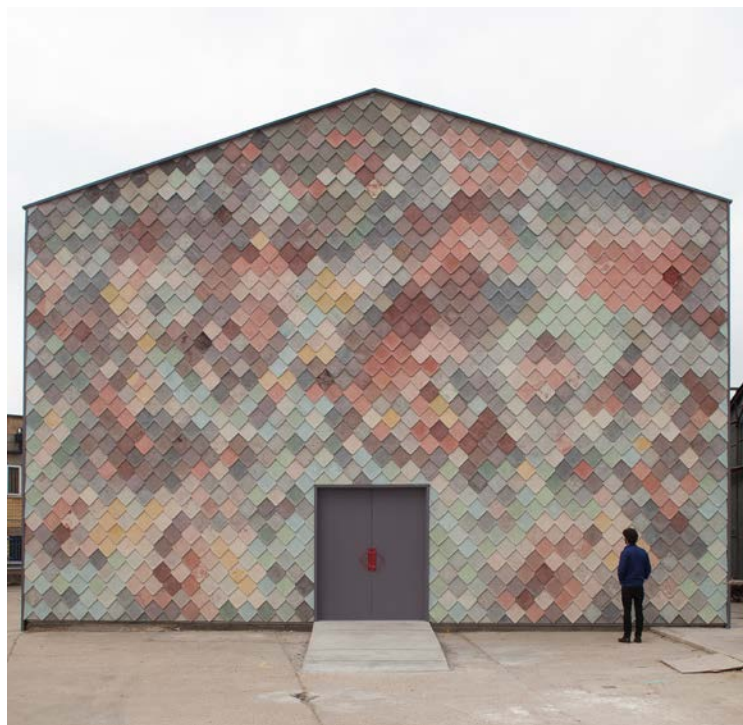
Fig. 7. Yardhouse, 2014 by Assemble. The facade is made from concrete tiles. The colourful tiles is hand made on site.

Even though the variability of SSA challenges its usage in cement based materials and application in construction, it also confronts the general idea and requirements for uniformity especially when thinking about concrete. For construction materials such as brick and wood, variation in colour and texture is in contrary, often desired and thrived for as aesthetical qualities that add value to the build environment. And although SSA containing concrete could be used at places where the colour is less important e. g in hidden structures there is also a possibility to incorporate variability into a design solution of a facade. As a good example can be mentioned Yardhouse designed by the London based architecture collective ASSEMBLE. The design solution for the facade exhibits how variation intentionally can be included by using coloured concrete tiles in an unusual scale for normal concrete facades Fig. 7. Thus, variation of cement based materials can be aesthetically unfolded through rethinking scale and component. And as such, SSA shows potential as a secondary resource for colouring concrete, and if the aesthetical aspects such as colour are taken into account at an early stage, it could challenge a general idea that concrete is a grey, and in some views, a drab material.