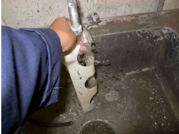
Fig. 1. The paper was moistened before it was placed on the base of the mould.

The paper cuttings used to generate rough and smooth surfaces of the hardened mortar was created by cutting a circular shape out of the lining paper using a circle cutter. The paper was moistened by placing it under running water for a few seconds Fig. 1. Before the frame was mounted, the paper cutting was placed at the base of the mould and evened out with the means of a wall paper brush Fig. 2. The samples were casted in moulds made from film faced ply wood. The dimensions of the moulds were either 100x100x30mm or 200x200x30mm. For the colour scale a steel mould was used. The samples measured 80x40x40mm.