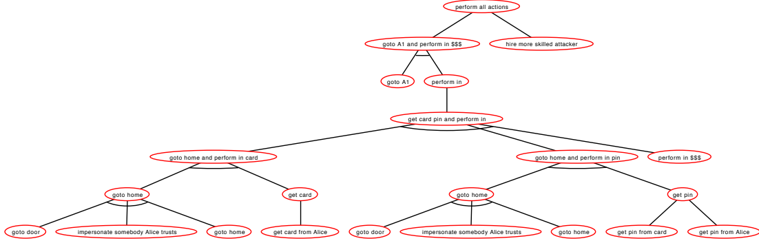
Fig. 6. Attack tree generated by the prototype implementation for the example shown in Figure 1.

the in action is the money location at the ATM A1. The location and action pair \{(A1, \mathbf{in})\} is therefore the only goal, and next \vdash_P from Figure 4 generates the attack tree for moving to A1 and performing the in action.