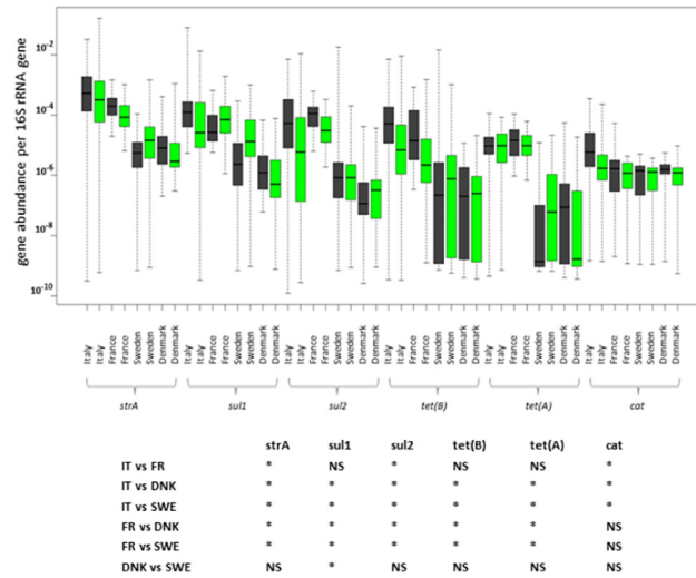
Fig 1. Abundance of antibiotic resistance genes in fecal microbiota of conventional and organic pigs. Antibiotic resistance gene abundance is presented as median, 25th and 75th percentiles (box) and the whiskers indicating the minimal and maximal values recorded. Black boxes, abundance in the microbiota from conventional pigs, green boxes, abundance in microbiota from organic pigs. As shown in the table embedded within the figure, country of sample origin (IT–Italy, FR–France, DNK–Denmark, SWE–Sweden) was a significant source of variation (ANOVA followed by Tukey HSD post-hoc test, P < 0.01 , asterisks indicate significant difference, NS–Non Significant). On the other hand, comparison of antibiotic resistance gene abundance in feces of pigs from organic and conventional farms within the same country reached statistical difference only for sul2 , tet(B) and cat abundance in Italian samples (ANOVA followed by Tukey’s HSD post-hoc test P < 0.01 ).