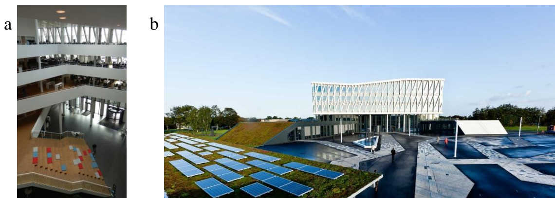
Fig.1: (a) Interior view of the atrium with broad staircase; (b) Town Hall architecture and landscape.

New Town Hall, designed by Henning Larsen Architects [6] and constructed by COWI [7] in 2011, is accommodating municipality of Viborg, see Fig. 1. It is a five-story building with a gross floor area of 19,400 m 2 . The Town Hall's energy consumption was designed to meet the requirements for low energy class 1: (50 + 1100/Heated Area) kWh/m 2 , according to Danish building regulations [8]. This was achieved by compact building geometry, energy-efficient glazing and solar protection, natural ventilation and mechanical ventilation with heat recovery (efficiency 85%), and district heating as well as groundwater cooling. All installed systems are managed by an intelligent Building Management System (BMS) that measures indoor air quality and temperature. It also controls natural ventilation openings in the building envelope. Mechanical ventilation is used only in meeting rooms and canteen.