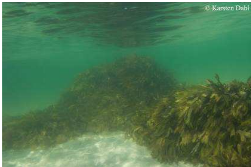
Figure 7. Dispersed stones on sandy bottom close to Hornbæk plantage.