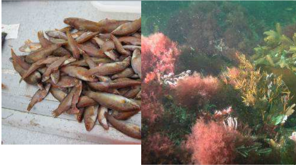
Figure 3a-3b. 3a (left): Caught of ballan wrasse. 3b (right): Multi-layered algae community at 6m depth from Briseis Flak in the southern part of Kattegat.