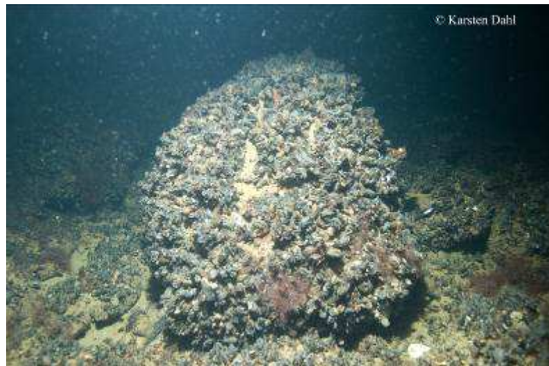
Figure 5. Stone reef at Møns Klint on 17m depth. Common mussels dominate the biomass but between the mussels can also be found the algae “gaffeltang” ( Furcellaria lumbricalis )

The fish fauna will typically be relatively poor in species. The goldsinny wrasse will often be the only species from the wrasse family. The goby species will often be two-spotted gobies, black gobies and sand gobies and from the codfish family only cod will be present. Sea trout also tolerates low salinity, and they can be found on these stone reefs, particularly during winter when they migrate to areas with lower salinity. Perch is also one of the species which can be observed.