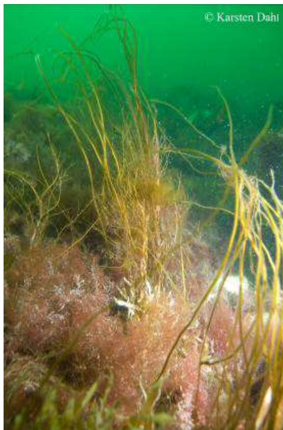
Figure 6. Algae community with typical opportunistic species. “Strengetang” ( Corda Filum ) is a characteristic species for unstable bottom. Photo from Læsø Trindel 6m depth in 2007 before the restoration project.