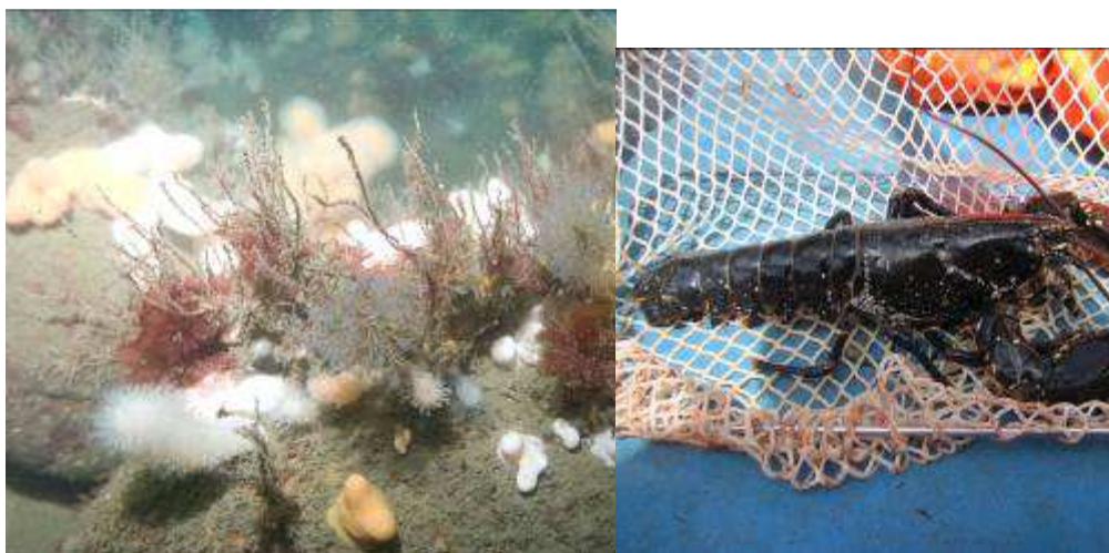
Figure 4 a-4b. 4a (left): Community dominated by the soft coral dead men's finger and hydroids, which both are typical elements on the deeper stone reef. From the stone reef "Den Kinesiske Mur" at 18 m depth. 4b (right): Lobster.

Biological contents: hard-bottom fauna typically dominates with some algae. Typical species are moss animals at very high salinity, the soft coral dead men's fingers (figure 4a) which also require relatively high salinity, a wide range of fungi and sea anemones, as well as common mussels in the western part of the Baltic Sea (figure 5). Fish fauna will be dominated by larger species from the wrasse family such as ballan wrasse, and adult codfish such as cod and coalfish. From the goby family, the sand goby and the glass goby will be common. Catfish is also one of the species which can be found on the deeper stone reefs together with lobster (figure 4b).