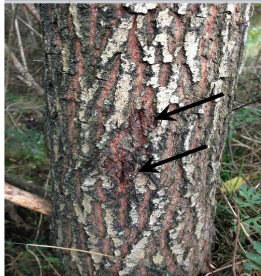
Figure 3: Stem of a willow tree one year after sampling. The two sampling perforations have almost healed.

The extraction of tree cores leaves holes in the stems behind (see figure 2 and 3). The trees respond to these wounds with compartmentalization. Compartmentalization includes the process of forming boundaries to isolate the injured tissues and hereby resist pathogens (Shigo 1984). This means that tree coring should not increase the frequency of tree death, even when excessive drilling is done (Weber and Mattheck 2006).