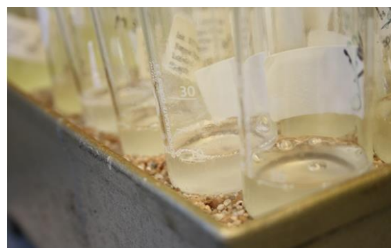
Figure 4: a) Decay of the tree cores in HNO 3 on a sand bath.

b) After the addition of H 2 O 2 and end reaction.