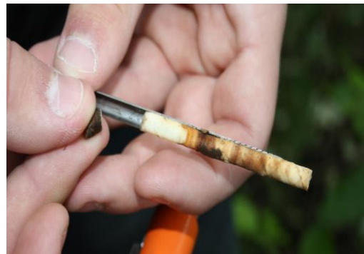
Figure 1: A tree core sample with the bark removed.

The use of wood, extracted from the stem of trees, as a bio-indicator for subsurface pollution is termed tree coring. Trees are to be preferred to smaller plants as their large root system can absorb chemicals from a larger area (the root system can be larger than the crown of the tree [Dobson and Moffat 1995]) and greater soil depths (pollution down to 19 m has been detected by trees [Sorek 2008]). Furthermore, the wooden parts of the tree are available all year in contrast to e. g. leaves.