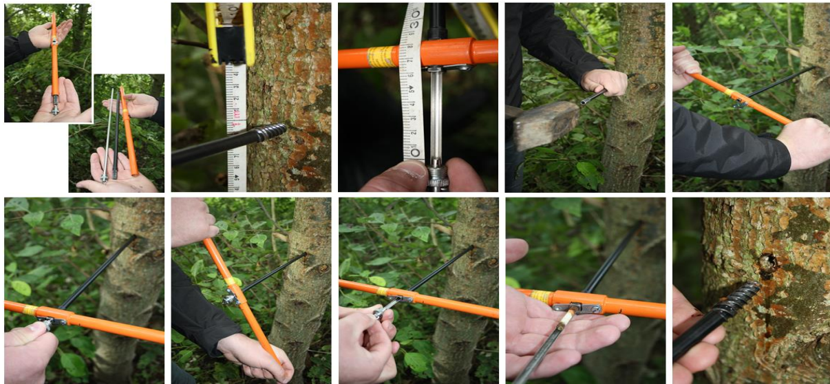
Figure 2: The tree coring procedure using a SUUNTO borer.