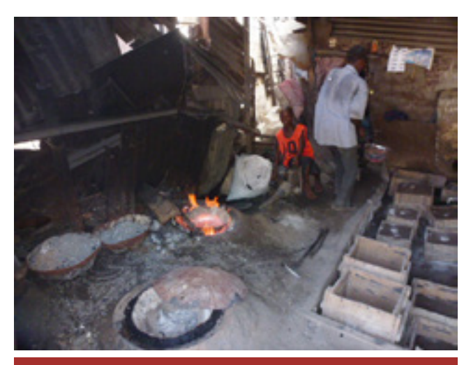
Inefficient cooking in peri-urban area, Senegal.

Tables 1 and 2 summarize the main demand and supply side barriers to LPG and electricity access for urban poor communities.