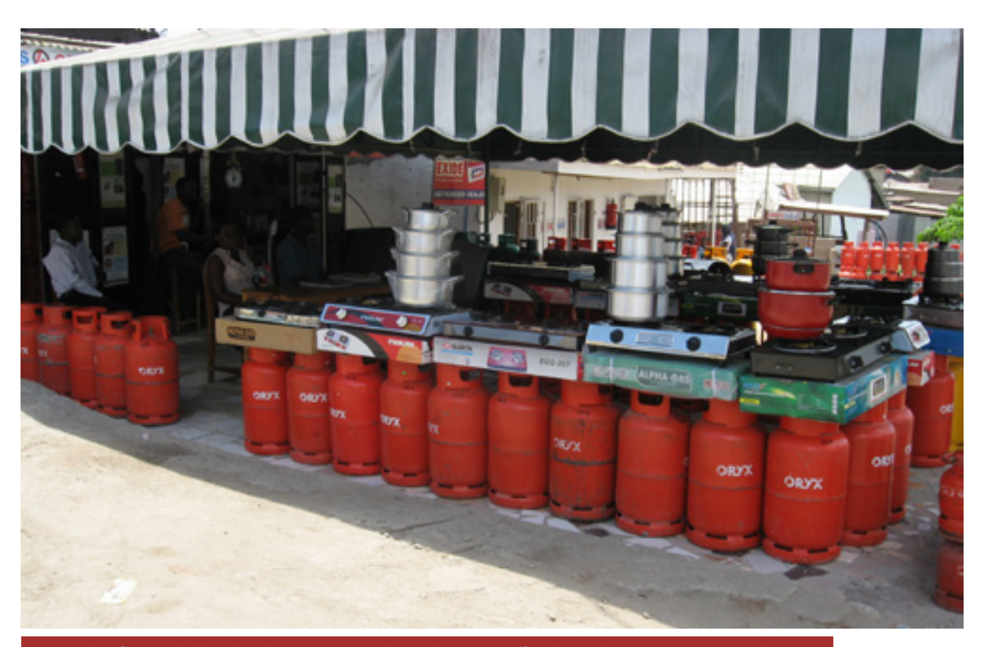
One stop shop for LPG cylinder and cooking stoves, Accra, Ghana.

with supply agencies, should promote and allow tenureship alternatives in order to facilitate legal connections to electricity and improved access to LPG. For instance, voter ID cards and affidavits from a local ward councillor should be accepted as valid proof of residence documents for the issuance of connections. As highlighted in the 'Good practices' section, Thailand's initiative in issuing temporary residential proofs (quasi-household IDs) that enable access to clean energy connections for the urban poor can be replicated elsewhere.