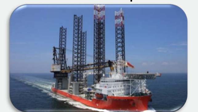
Figur 2: Innovation bio. of Pacific Orca, Swire Blue Ocean Pacific Orca is an offshore installation vessel. Six 105 m legs makes it safe to operate in wind up to 20 m/s.

Most studies treat innovation as an outcome measured by patents or innovation statistics, however it is important to remember that innovation processes are contingent processes that unfold over time. Consequently, I apply an 'innovation biography approach' that focuses on the entire "lifespan" of the innovation process from idea generation through problem solving to implementation. Hereby, I can study the type of knowledge, its geographical source and when during the innovation process companies chose to integrate external knowledge. The study comprises three innovative event, each has been documented through 2-3 interviews per case including secondary data and documents.