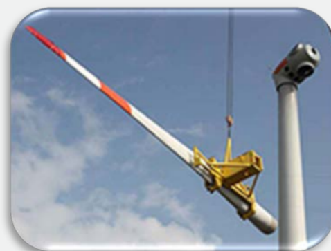
Figur 1: Innovation biography of Blade Dragon, Liftra A/S Blade Dragon is a yoke that enables installing blades on rotors in most angles (+30 to -5). It can perform in wind up to 12 m/s.

The wind power industry has undergone significant change during the last couple of decades which has resulted in an internationalisation of the industry. Due to a strong focus on mitigating the environmental impact of energy production as well as increasing energy security we see a continuously increasing world wide demand for renewable energy sources, including wind power. This has attracted a diverse range of OEMs from different world regions and today the industry is no longer dominated by Danish wind turbine manufacturers. Activities related to manufacturing, sales and more recently research and development has been internationalised. This study focuses on suppliers located in Denmark and asks whether these companies are able to adapt to the new international agenda and take advantage of both local and international knowledge sources in the development of new innovations.