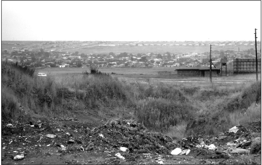
Figure 3: Refuse dump area immediately upstream of the B field potable water abstraction boreholes