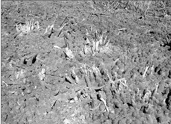
Figure 5: Example of AMD in the Merafong City's municipal area