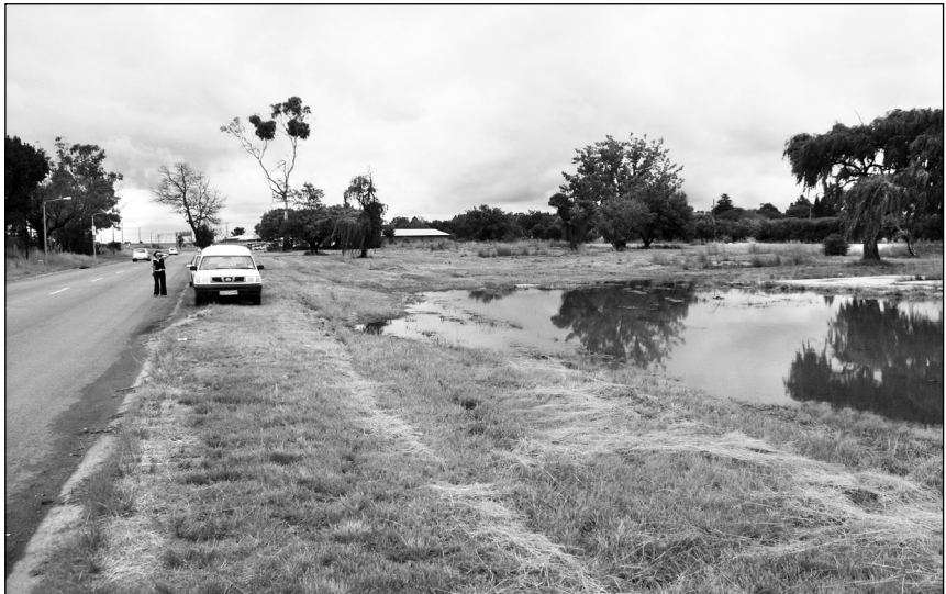
Figure 4: Small surface dam of raw sewage near the D field potable water abstraction boreholes and 300m from the municipal offices in Delmas