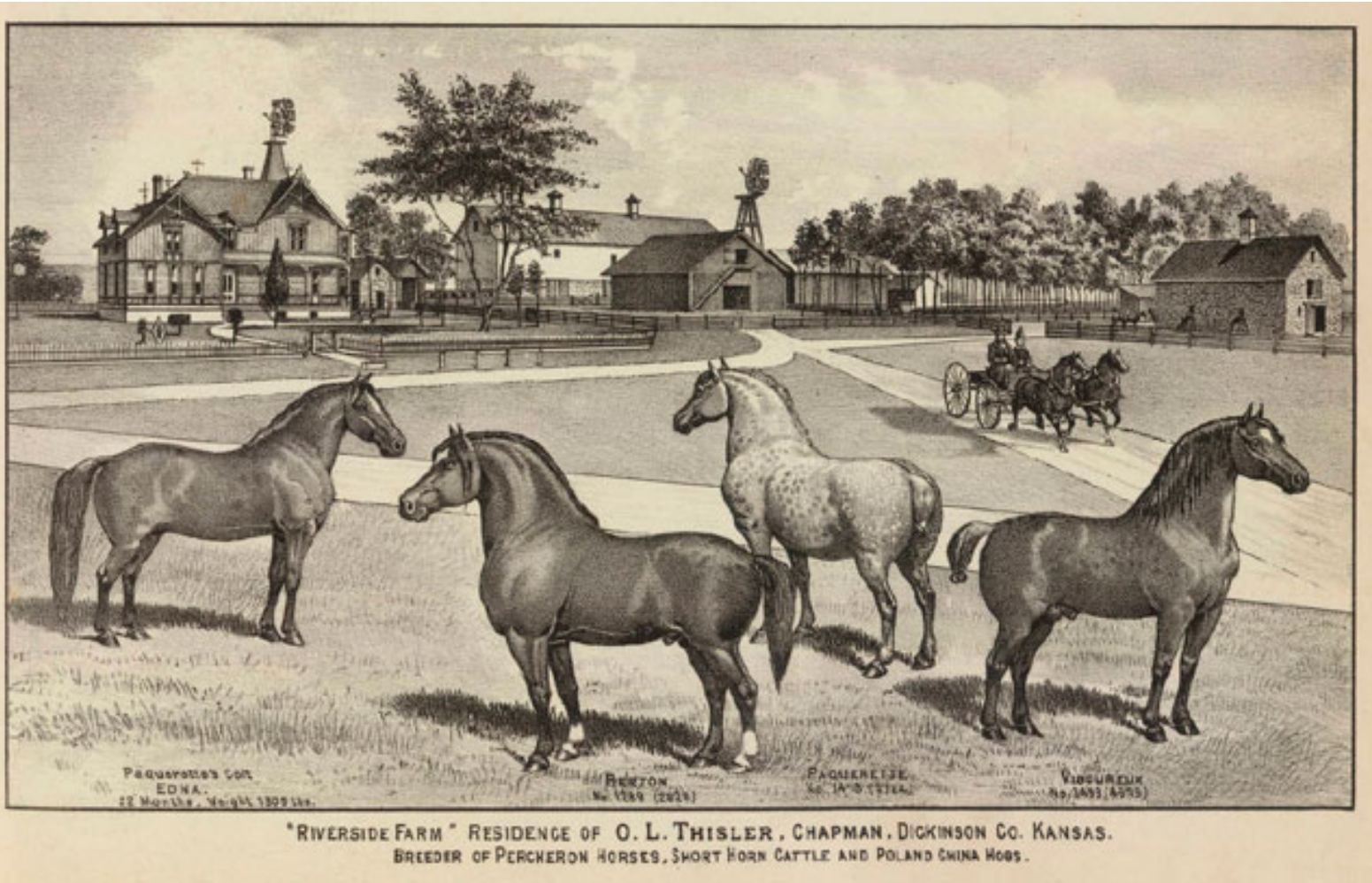
Figure 3. Kansas Farm Scene. From Official Atlas of Kansas.