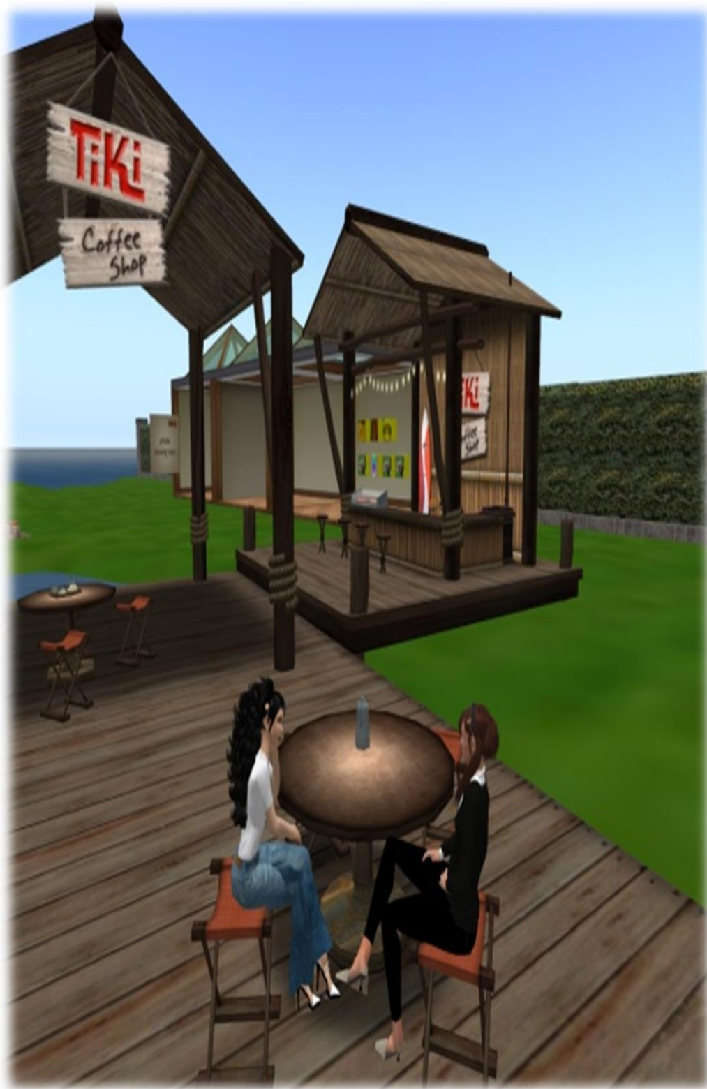
Figure 2.3 Two human avatars in Second Life