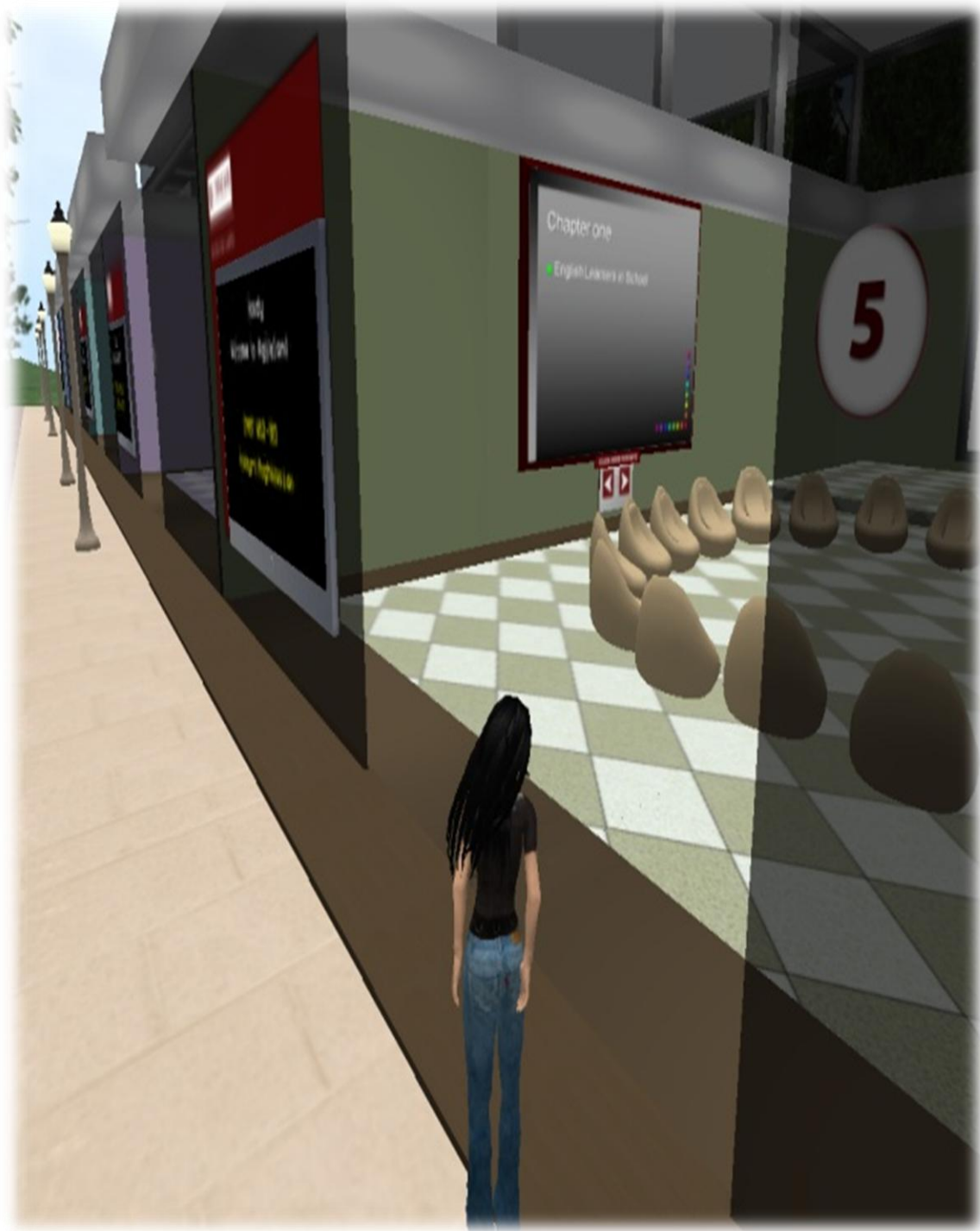
Figure 3.2. The non-seductive setting in Second Life: Outside view