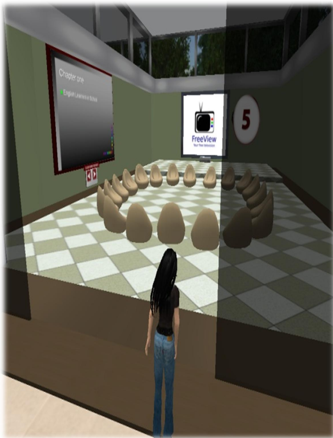
Figure 3.1. The non-seductive setting in Second Life: Inside view