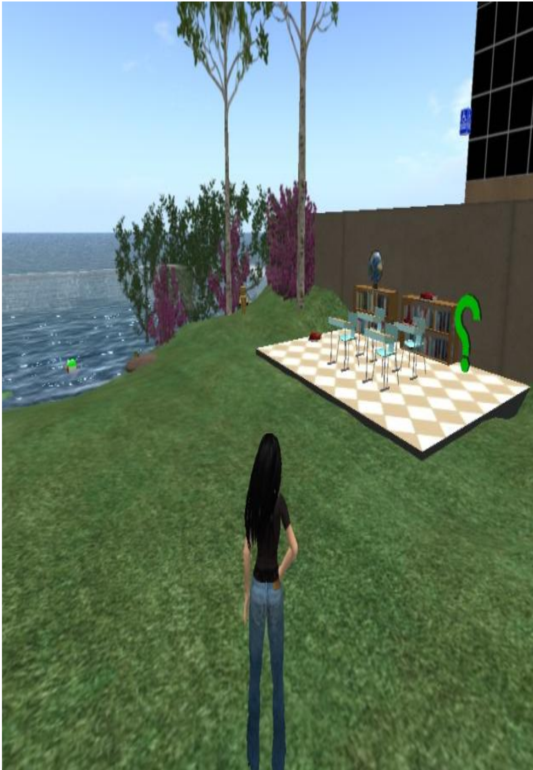
Figure 3.4. The seductive setting in Second Life: The ocean view