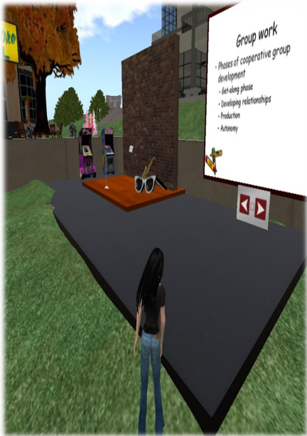
Figure 3.3. The seductive setting in Second Life