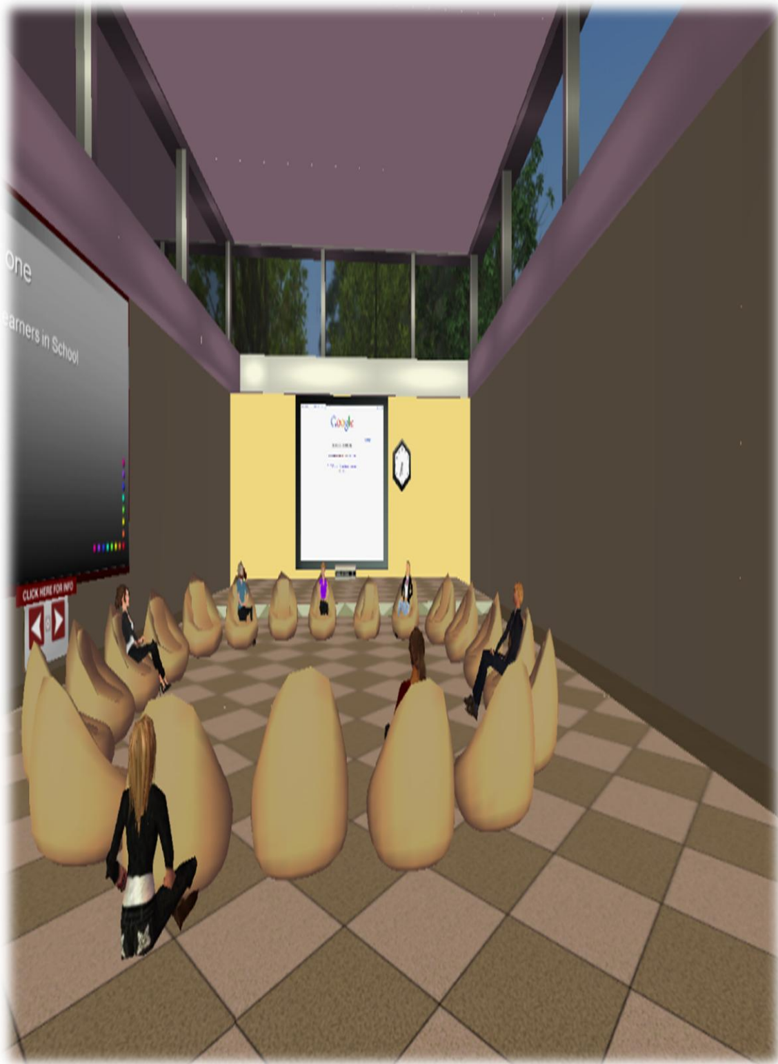
Figure 3.5. Graduate and undergraduate students in the non-seductive setting