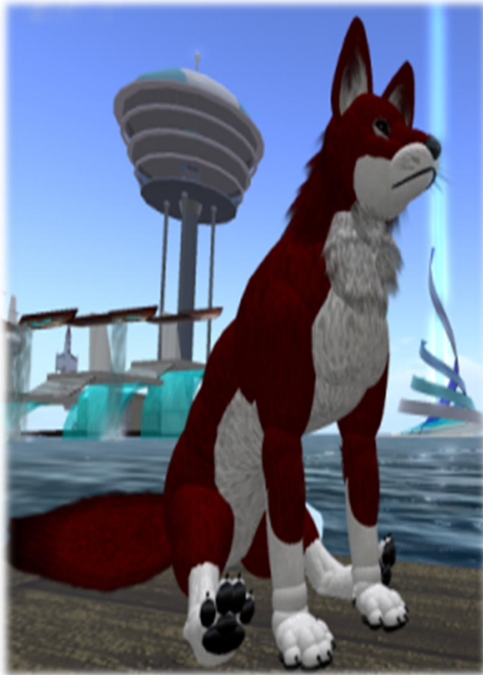
Figure 2.2. An animal avatar in Second Life

Raven, P. (Photographer). (2009). Kim Stanley Robinson to appear in Second Life... as a coyote [Snapshot]. Retrieved September, 2011, from http://futurismic.com/2009/01/12/kim-stanley-robinson-to-appear-in-second-life-as-a-coyote )