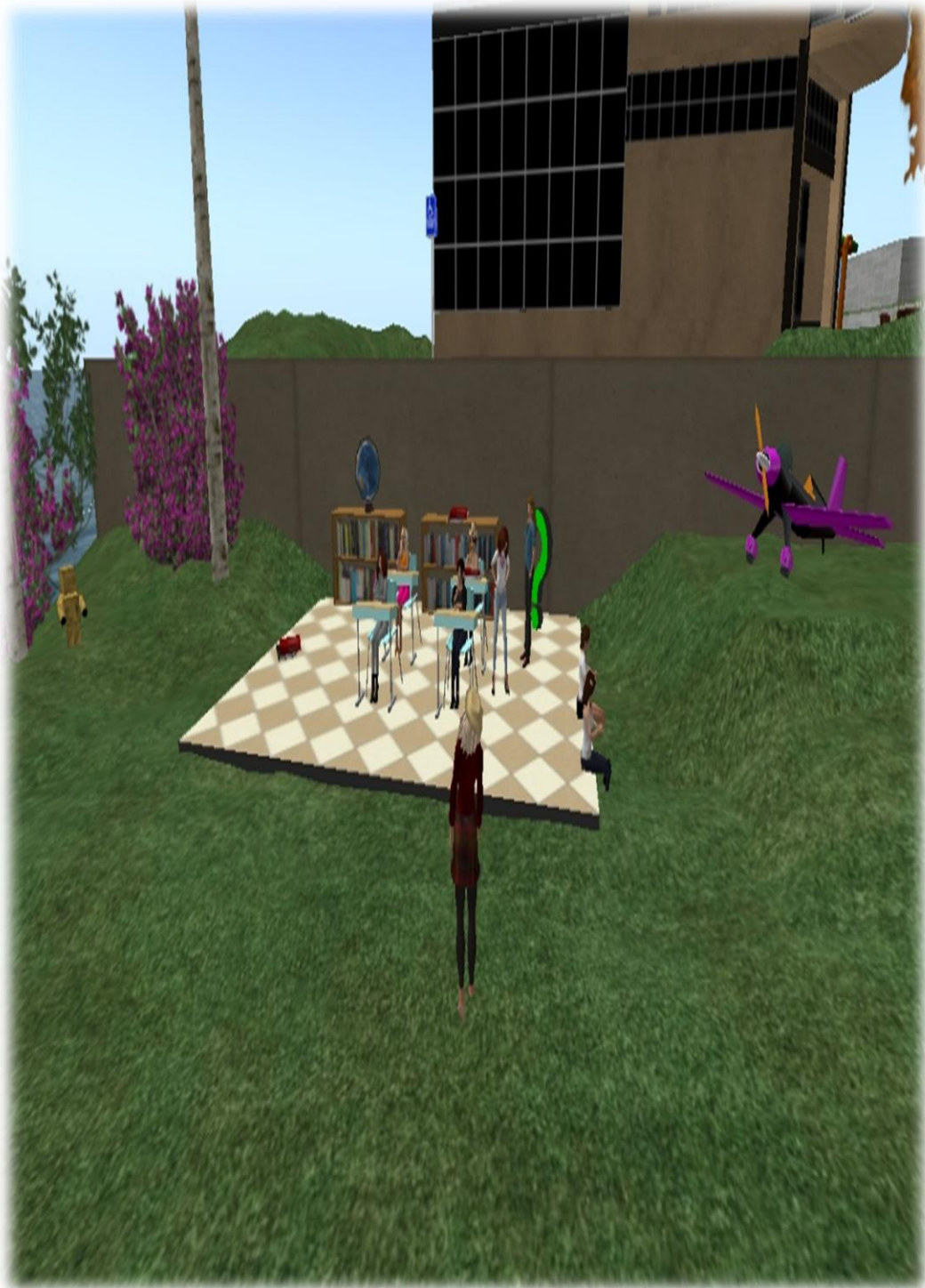
Figure 3.6. Graduate and undergraduate students in the seductive setting