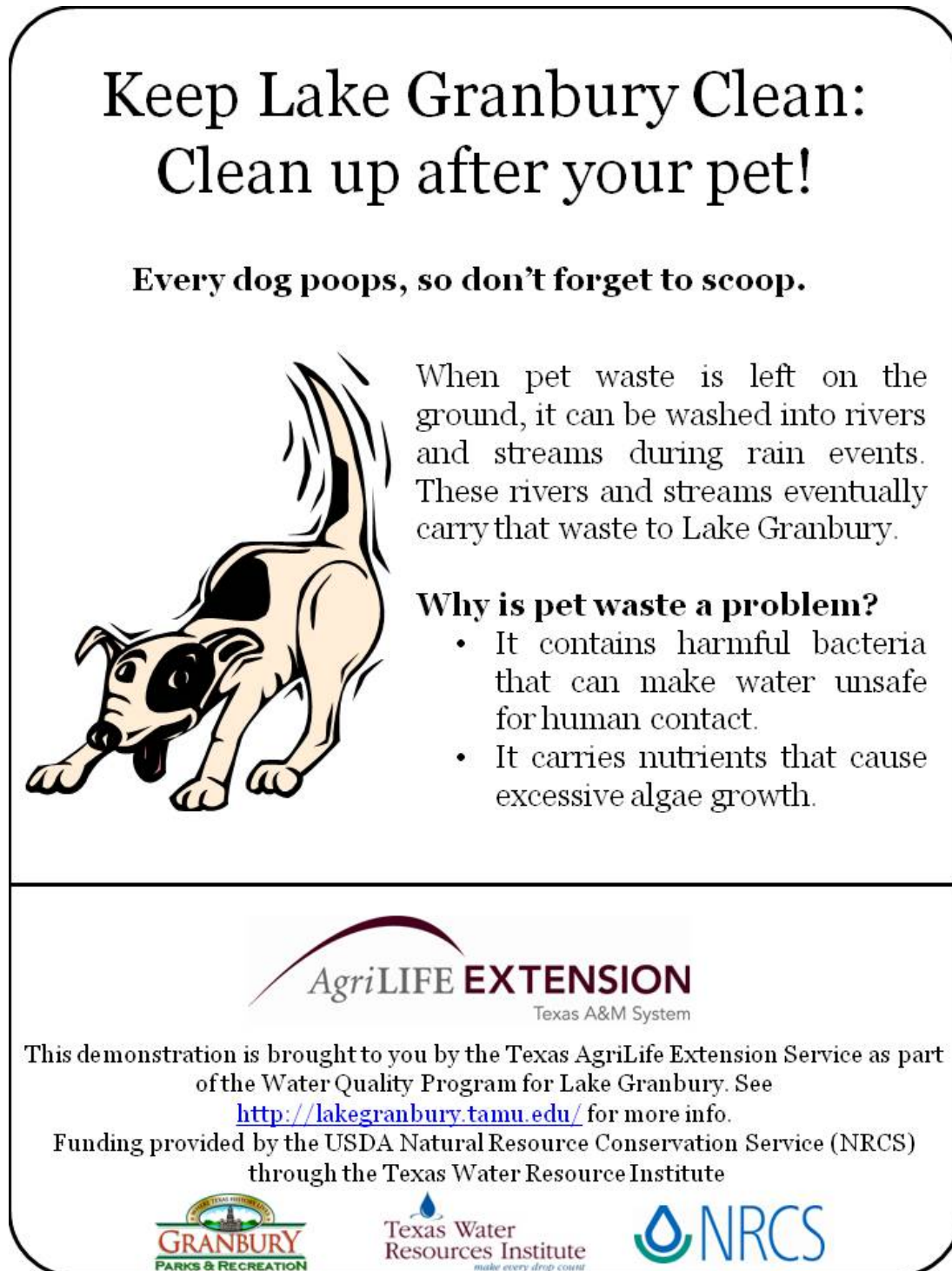
Figure B-1. Image of informational sign used on pet waste stations along the Granbury Hike and Bike Trail.