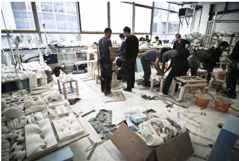
Figure 2. IDE-AADRL Collaboration, work in progress.

The material computation masterclass ran in 2009 as a collaboration between the RCA IDE and the AADRL graduate students aimed at uniting architectural and industrial design physical and conceptual skills in a materials computation masterclass. It was focused around the use of latex and plaster to explore flexible forming of components and structures. The value of the collective environment was leveraged through the interfacing of architectural notions of structure and programme with Industrial design process, manufacturing and component detailing inputs. During the 5 day workshop 60 students used 2 tonnes of plaster to make over 100 castings in a continuous evolution of forms (see Figure 2). The modus operandi began directly with making as a conscious strategy to quickly integrate the groups. The final outcome allowed students to collaboratively explore tactile empirical forms of form making outside of CAD environments and to realize that some forms and their methods of generation fall outside of the digital domain.