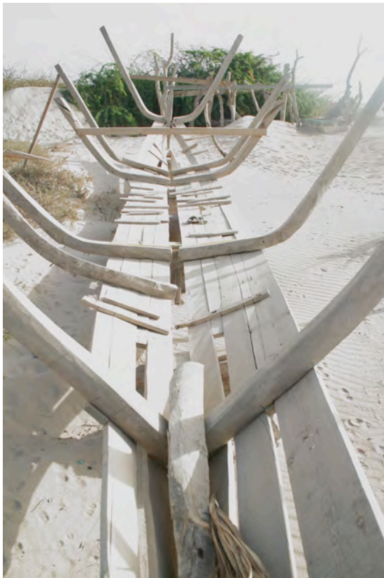
Figure 13. The hull of a hūrī in its early stages of construction: the planks have been heat-shaped and built up from the garboard strakes around five guide-futtock pairs. Note the absent keel. (J. P. Cooper)