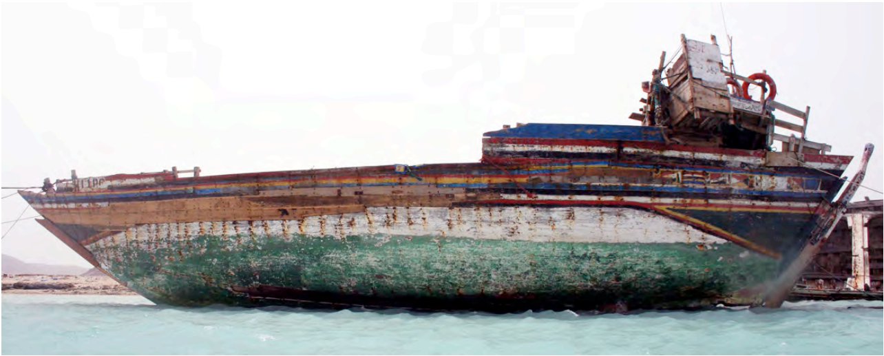
Figure 5. An abandoned zarūq at Khawr al-Ghurayra . (C. Zazzaro)

allow a prop-shaft to emerge into a space, forward of the stem-post, created for the propeller. The wash of the propeller passes over the stem-post and the rudder blade attached to it. The midships area is open to the hold, with decks fore and aft. The term ʿobrī is not mentioned in previous literature on Yemeni craft, but craft is clearly the “ ibʿri (sic.) ” whose construction Perrier describes, 27 and the vessel type is clearly the “ sanbuq ” encountered by Prados in the early 1990s 28 .