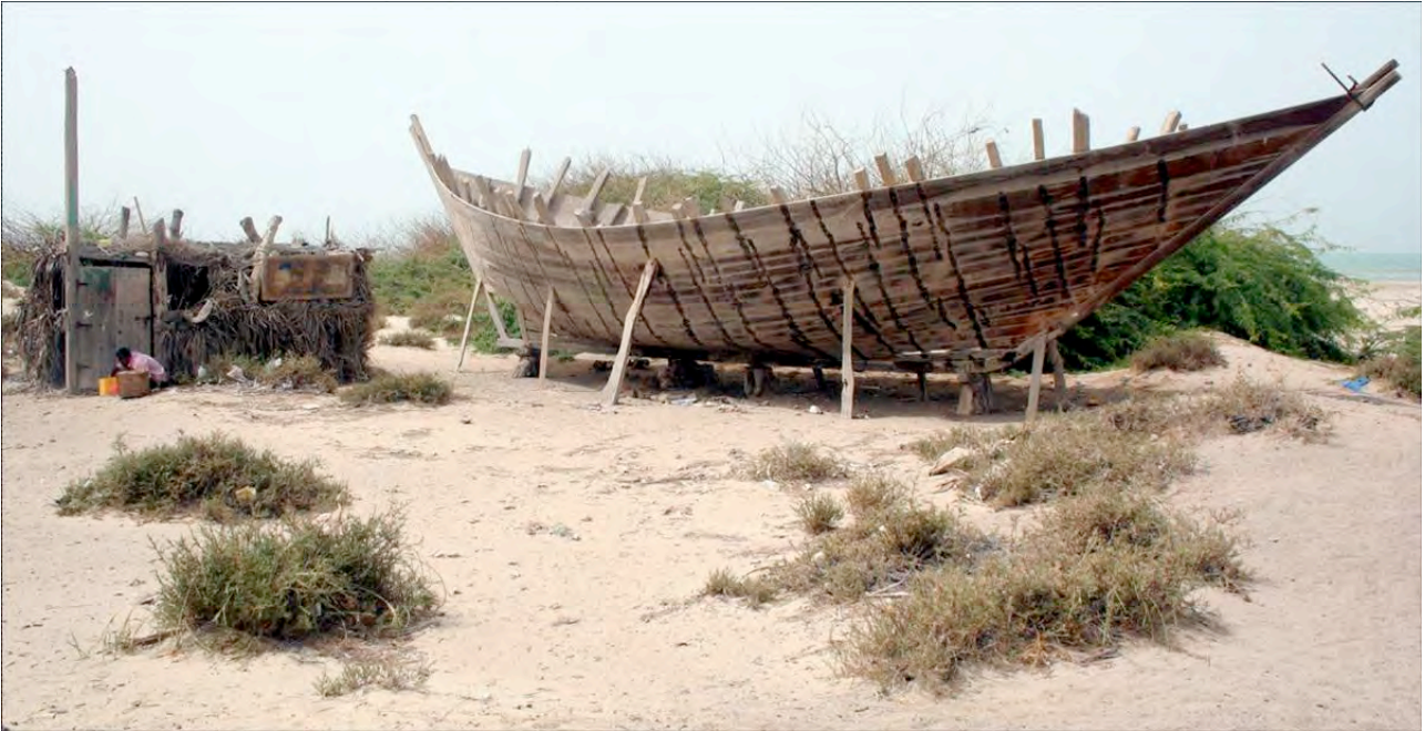
Figure 8. An artisanal boatyard at al-Khawkha, comprising a small carpenter's hut and open shelter, alongside an open-air boatbuilding area with an almost-complete, but abandoned, 'obrī.

locations visited. Many builders said that it had been several years since they had built an entire vessel. The only activity observed during the MARES fieldwork was in al-Hudeida, and involved the repair and replacement of the lower planking of a traditional wooden vessel, caulking the hull, and the application of wood preservation coatings to the outer hull.