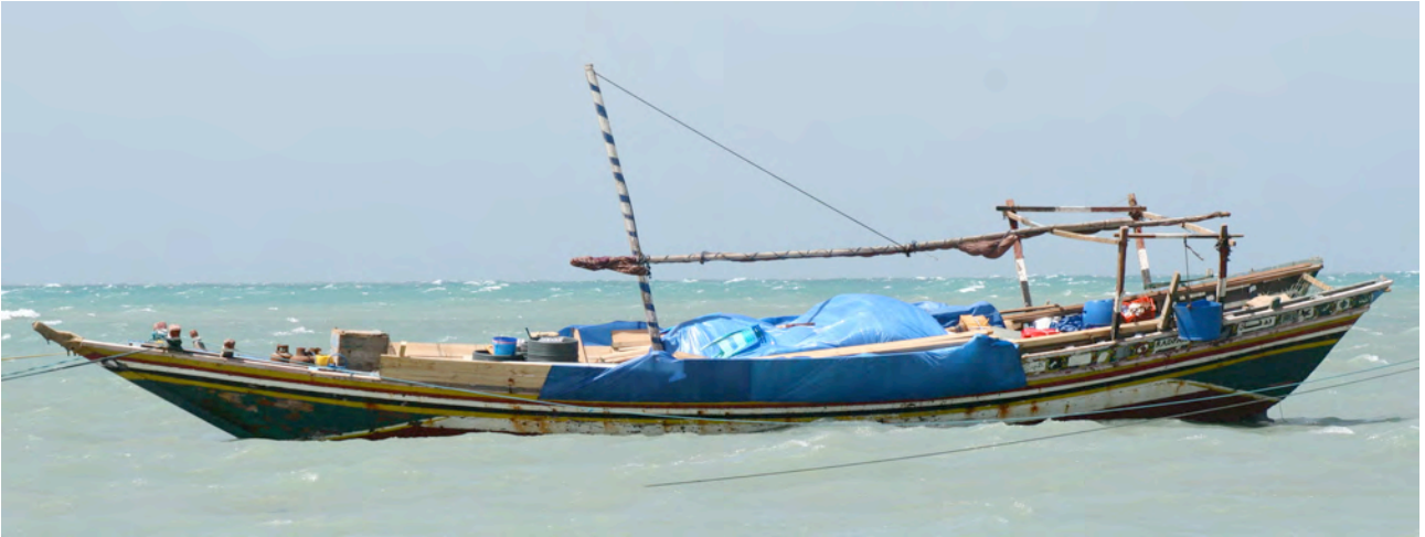
Figure 3. A large “winged” hūrī in the sea at al-Khawkha.