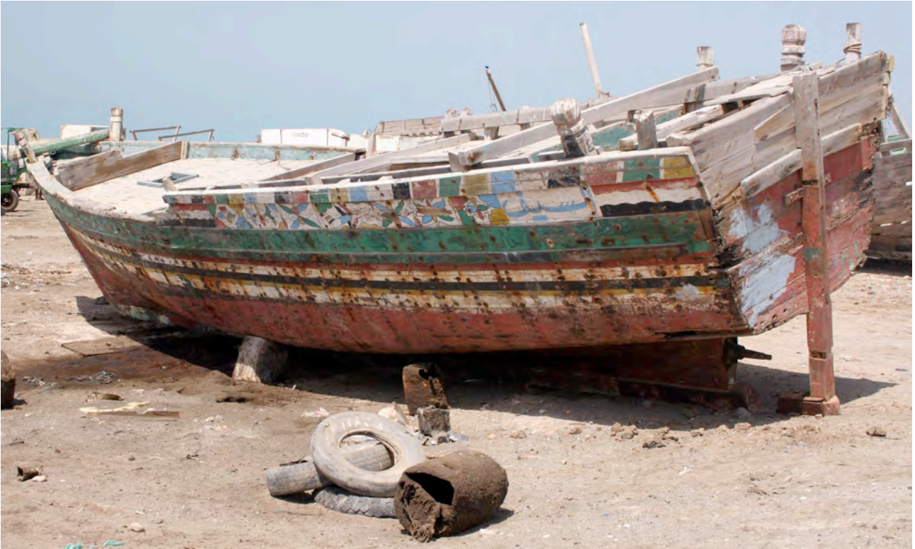
Figure 7. A bōt at al-Ḥudayda. (J. P. Cooper)

Hornell, Villiers and Prados. 40 No surviving material evidence of these sā'iyas was found during the survey.