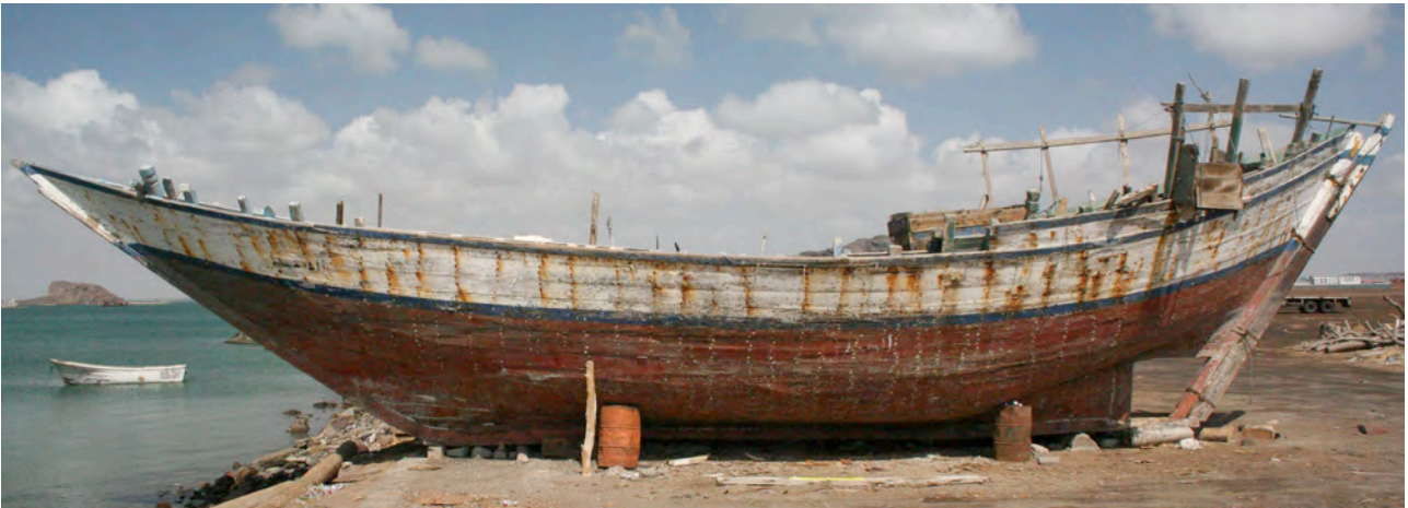
Figure 4. An ʿobrī propped at Dakkat al-Ghāz, Maʿallā, ʿAdan.