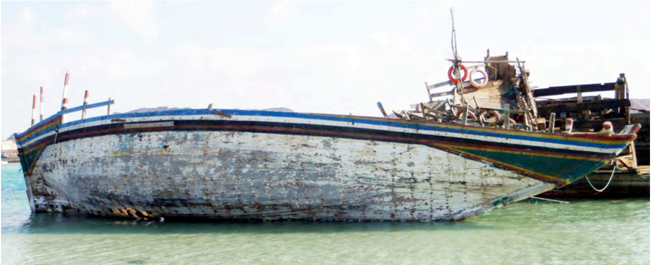
Figure 6. A zaīma at Khawr al-Ghurayra . (J. P. Cooper)

In the early twentieth century, both Moore 33 and Hornell 34 reported zaīmas observed at al-Hudeida and at Jedda, but their descriptions are vague and they provide no illustrations. In the 1960s, Pujó observed and photographed zaīmas in Djibouti. These were vessels up to 20m long with a capacity of 30 t and with the characteristic curved stem of the double-ended zaīma observed in Yemen by the present authors, but they had a transom stern. 35 Like many Arabic words applied to boat types, sanbūq has been applied to a wide variety of vessels. Hawkins observed during his visits to Aden that it was applied to almost any fishing boat, 36 while Prados noted that it was given to a type of small double-ended sewn fishing craft. 37 In terms of larger vessels, it was applied to those ocean-going cargo dhows that disappeared in the 1970s or 1980s. These had escutcheon-shaped transom sterns and upward-curving stemposts. 38 Originally having one or two masts, they later were converted to take an inboard engine. They were often highly decorated at the stern. 39 Similar to this type of sanbūq was the sā'īya , described in the last century by Moore,