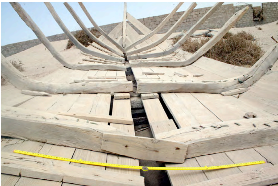
Figure 14. The space between the garboard strakes of the hūrī into which the keel will ultimately fit is kept uniform using string to prevent the strakes from parting (above), or chocks, which lock them in place (below).

additional futtocks. The process is neither entirely frame-first nor plank-first, but a mixture of the two, with the overall shape determined by eye, and realised through the build-up of futtocks and planking. 46 In both cases, the keel and floors are largely incidental to the