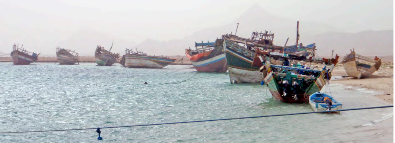
Figure 2. Vessels moored or abandoned in the creek of Khawr al-Ghurayra (C. Zazzaro)

Within the greater Aden area, members of the team visited the Inner Harbour at Ma'alla that was once the centre of the city's dhow-building and trading activity. Other small bays around the Aden peninsula were also visited, but it was only at Ma'alla, specifically Dakkat al-Ghaz, that evidence of dhows was found. On the al-Bureigha (Little Aden) peninsula, the team visited the fishing villages of Khisa and Fuqum, where abandoned dhows were also found.