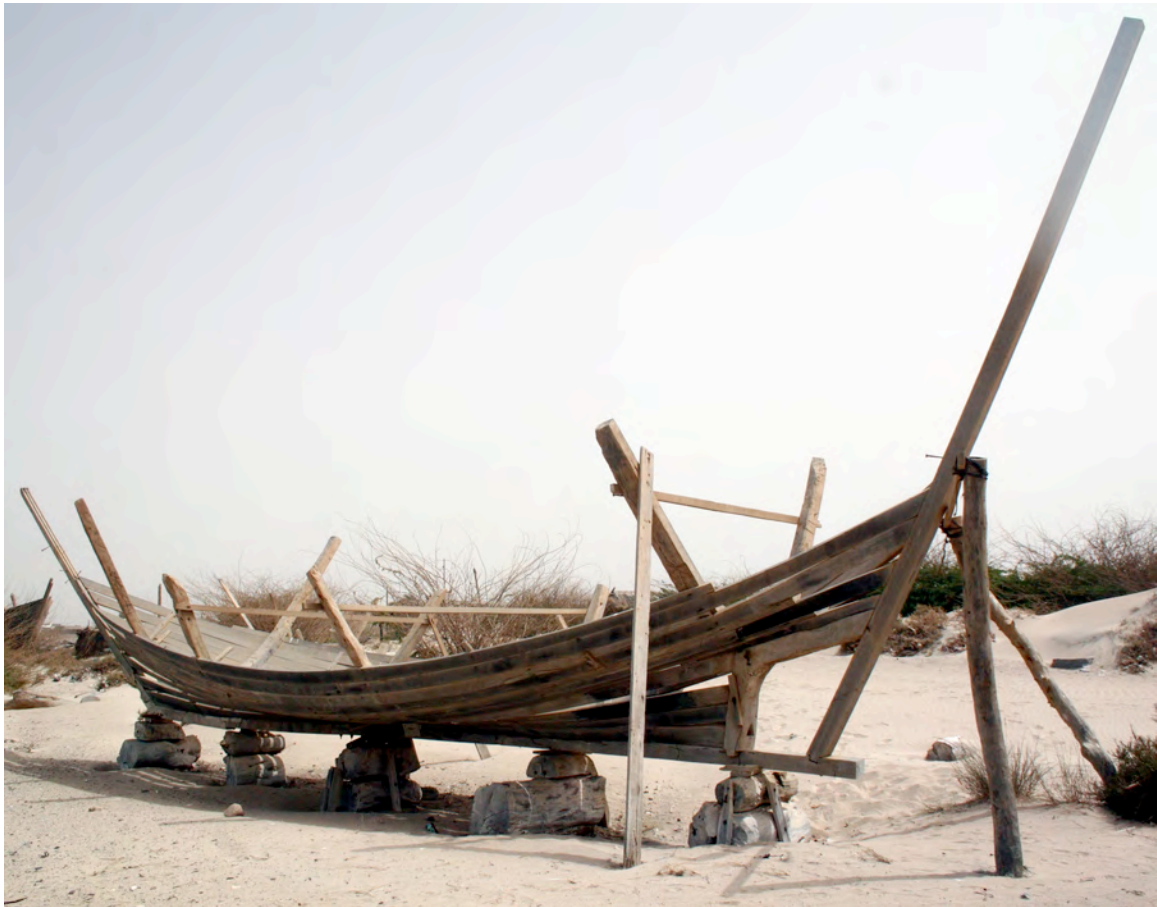
Figure 9. An 'obrī in its early stages of construction. The keel has been laid and rabbeted. The stem-post, stern-post and the L-shaped timber through which the propeller shaft will ultimately pass, also rabbeted, have been fixed in place. The four pairs of guide futtocks are visible, held in place by cross-spawls. (J. P. Cooper)