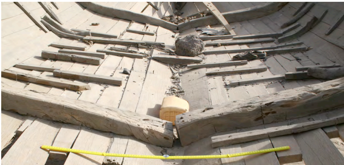
Figure 10. 'Obrī construction: adjacent strakes are held flush together using temporary battens and chocks. (J. P. Cooper)