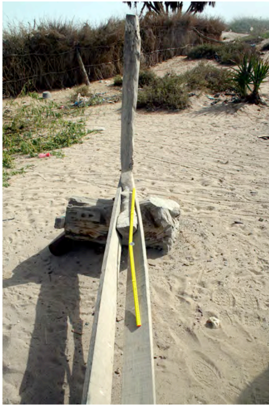
Figure 12. The first stage of construction of the hūrī: the garboard strakes have been heat-shaped, and are fastened at their ends to internal stern and stem knees. (J. P. Cooper)