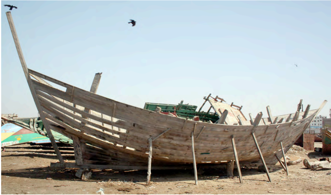
Figure 11. ‘Obrī construction: as the hull strakes are built up and the hull shape established, additional framing timbers are installed, here starting from the bow (right in picture). Upper futtocks may be added to secure the highest strakes.

akhmās , sing. khums ) are affixed at intervals along the keel. The shape of each futtock is established using a bent wire in the desired curvature of the final futtock, which is laid on a naturally crooked timber, and the shape traced on. Thereafter the timber is trimmed to shape using an adze or electric saw. The akhmās pairs are then nailed to the garboard strakes: the spread of each pair is decided by eye, and symmetry maintained using string and plumb-bobs. Each pair is then held in place using cross-spawls and sometimes external props. At this point the builder starts to build up the hull planking, with adjacent planks held together using temporary battens and chocks (Figure 10). When the lower hull planks are in place, additional futtock pairs are installed, with floor timbers alternating between these pairs and bolted to the keel. Upper futtocks are allocated to these as the hull planking ascends (Figure 11). Once the hull shape is thus established, internal stringers are attached, the inboard engine mounted, and the crossbeams, decking, and superstructure are added.