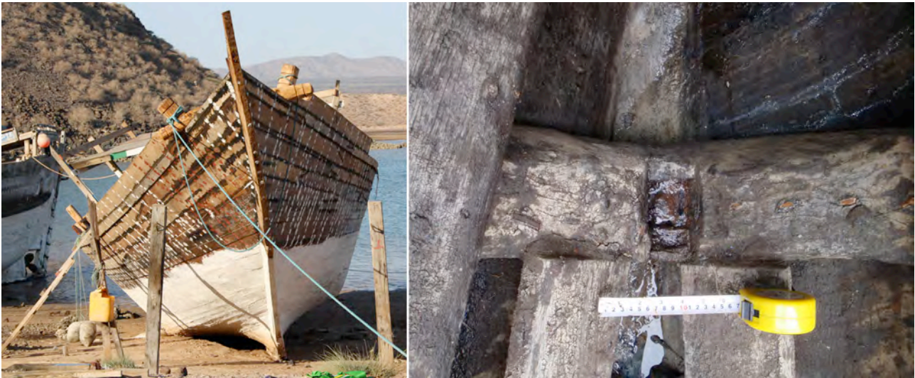
Figure 15. A zaīma hull covered with white shaham , a mixture of animal lard and gypsum ( nūra ) (left). The traditional coating for inside the vessel is called sīfa , a mix of shark oil, charcoal, and incense (right). (J. P. Cooper and C. Zazzaro)

muraymara ( Melia azaderach L.) 49 and damas ( Conocarpus lancifolius Engl) 50 were used extensively as hull framing timbers, for the timbers of the stem and sternposts, and for the curved samaka (or kirda ) timber that acted as the propshaft bearing in vessels with an inboard motor. Imported wood that fulfilled these functions included mīṭī , apparently from Somalia, and zur (or zann ) from Asia. Another wood sometimes used for framing timbers was called locally dayman , but no more information could be gathered about it.