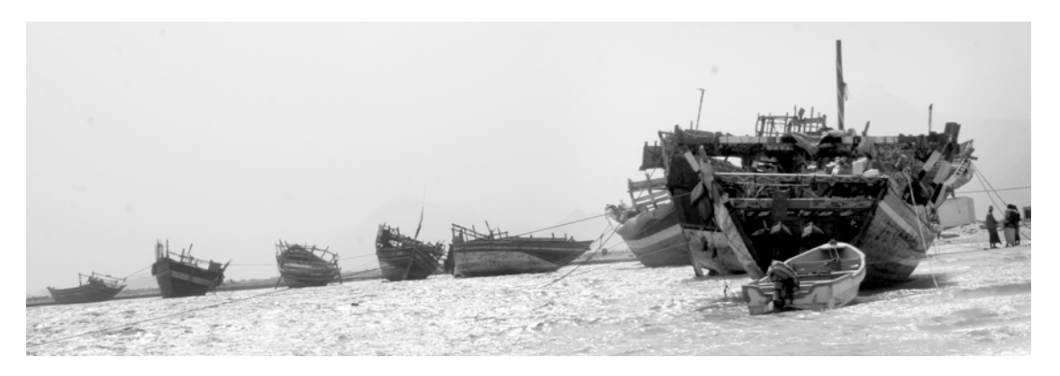
Figure 3: The creek at al-Ghureira, with abandoned vessels.

few other vessels in Maʿalla were fibreglass. Across the harbour, dhows could also be seen abandoned on the inaccessible island of Qulfatayn. Other abandoned examples of 'obrīs and large hūrīs were recorded at the Little Aden villages of Fuqum and Khīsah. In addition, small wooden dugout and plank 'canoes' (also called hūrīs) were observed abandoned, and occasionally still in use, at various fishing settlements in greater Aden.