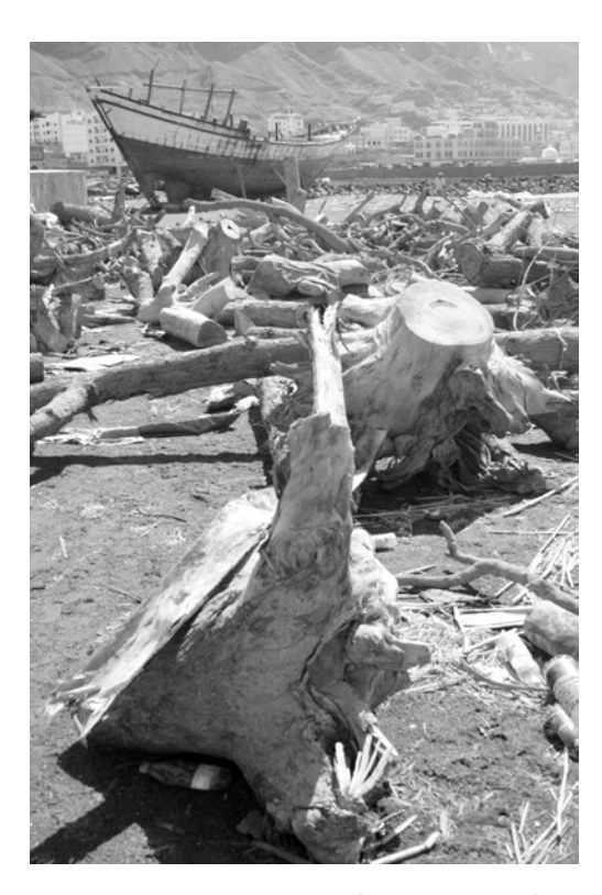
Figure 2: Relics of dhowbuilding at Dakkat al-Ghāz, Aden (MARES/J.P. Cooper).

reclaimed, and is now a lorry park. This appears to have happened since 1990, when Cooper visited Maʿalla and photographed the site. Wooden boat activity is today limited. The team recorded two wooden dhows – an 'obri and a bōt (see below for a discussion of boat typologies) – that had been hauled out and abandoned. A pile of wooden masts was also recorded. Local informants said that a large quantity of un-dressed timber at the site comprised locally grown woods known as damas (Conocarpus lancifolius Engl (Bilaidi 1978, on-line: 3)) and muraymira (Melia azaderach L.(Awadh Ali et al 2001: 175). These timbers formed natural crooks used to make futtock and floor timbers, and are indicative of an extensive former boatbuilding industry at the site.