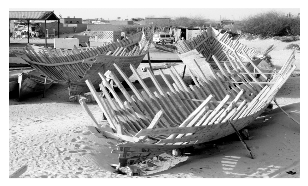
Figure 4: Abandoned boatyard in Khokha.