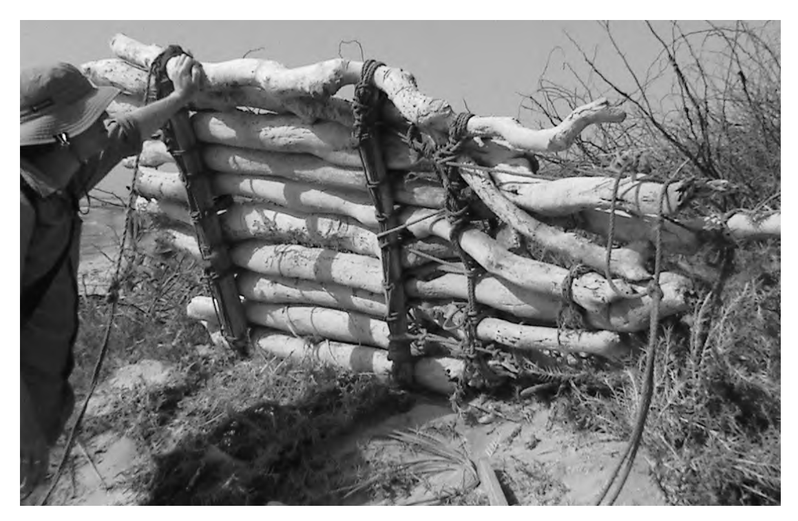
Figure 10: A ramas at Khokha.