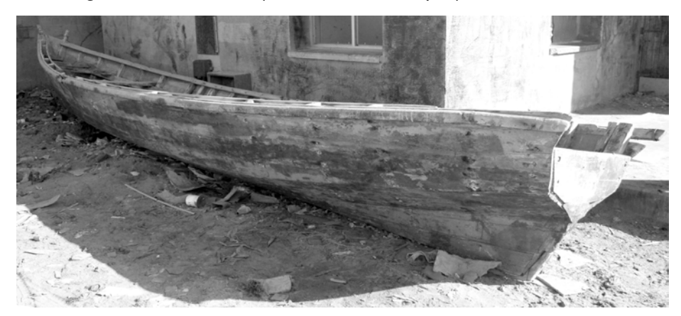
Figure 8: A galbah/jalbah at Fuqum, Little Aden.

forms of smaller fishing canoes that were also called h\bar{u}r\bar{r}^e . Interviewees referred to it simply as a h\bar{u}r\bar{r} , unless likewise distinguishing it.