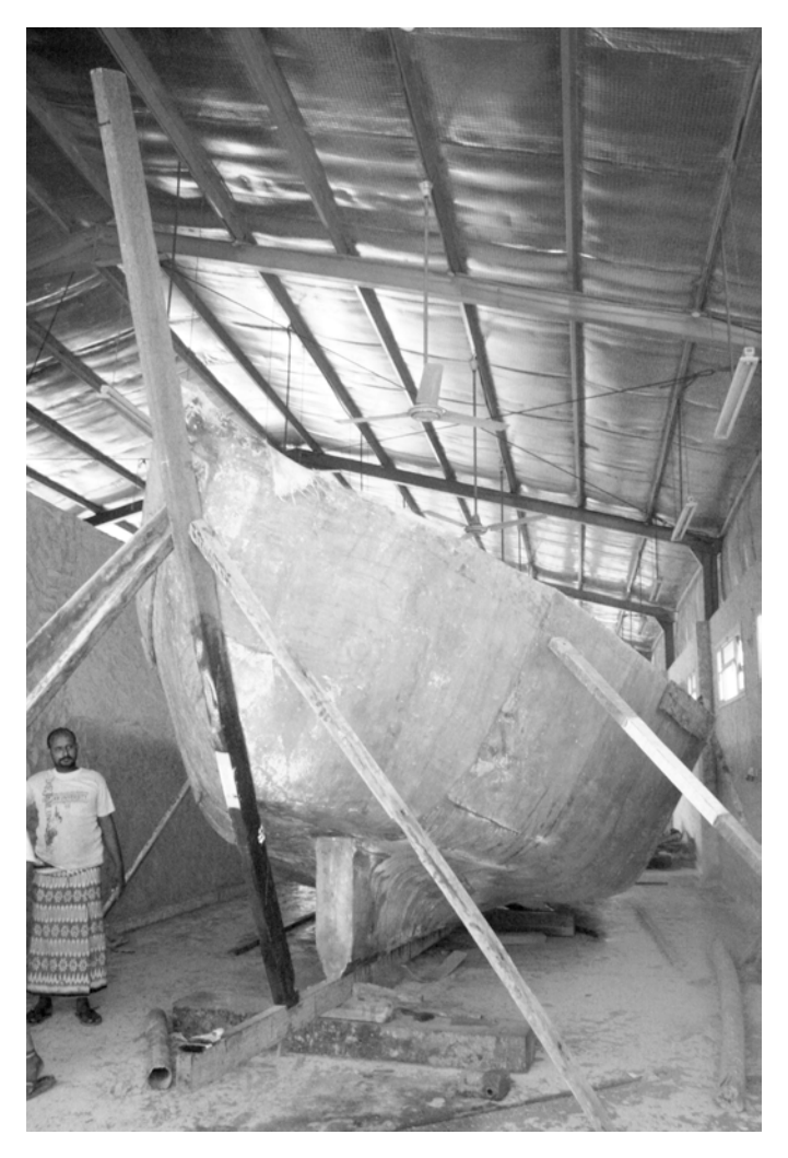
Figure 9: A fibreglass galbah under construction at al-Ṣalīf. The hull form retains that of the wooden 'obrī.

length and was 7.1 m wide. We tentatively associate this type of boat with the description of a s\bar{a} iya that informants outlined elsewhere, but the identification is by no means certain.