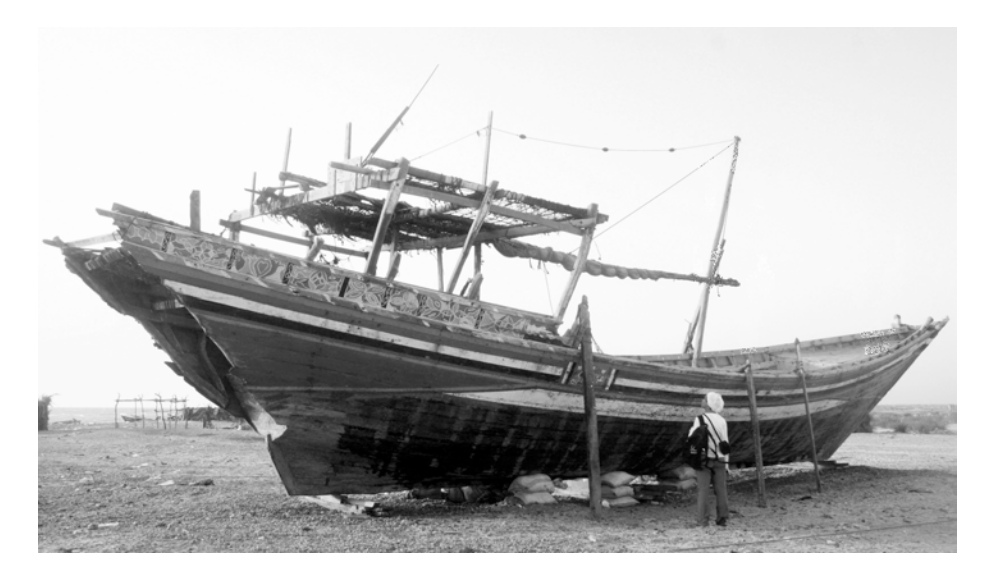
Figure 7: A 'large hūrī' at Khokha.