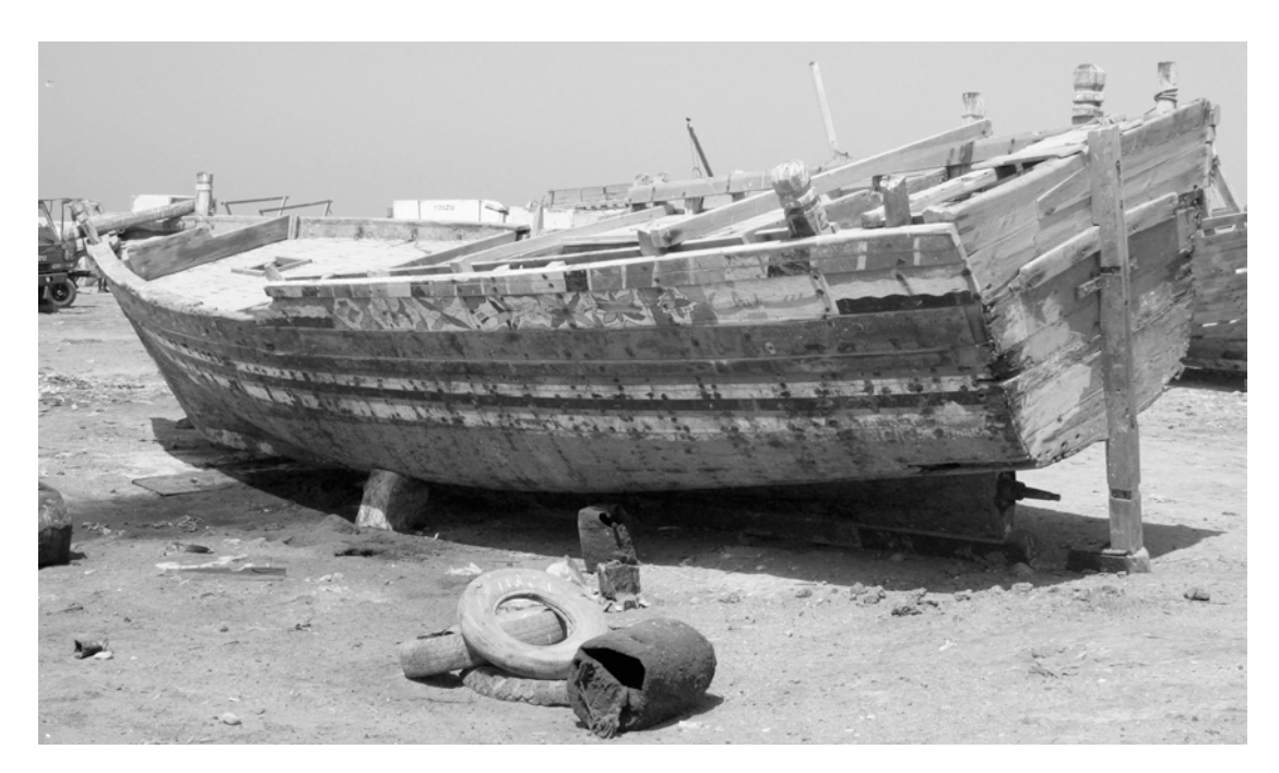
Figure 6: A bot at Hudeidah.

having an inboard motor (Figure 6). Informants unanimously identified this vessel as "not Yemeni", and variously attributed its origins to Oman or India. The MARES team subsequently observed similar craft in use in Djibouti.