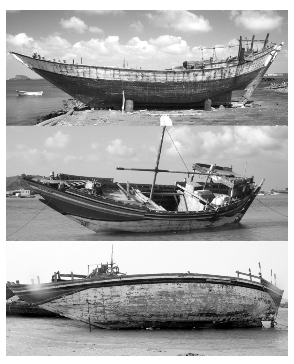
Figure 5: Three types of double-ended sanbūq found in Yemen – the 'obrī (top) in Aden, and zārūq (centre), and zaʿīmah (below), in al-Ghureira (MARES/J.P. Cooper, C. Zazzaro).

sometimes with an extant mast or mast step. These were generically referred to as sanbūq s, although specific hull shapes attracted more precise names, such as 'obrī , zārūq and zaʿīmah . The general shape and structure of these