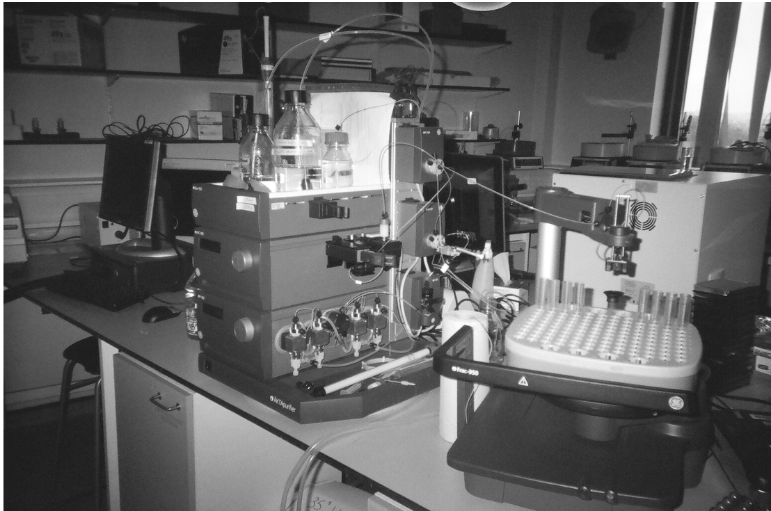
Figure 1. Protein purification machine costing £60,000.