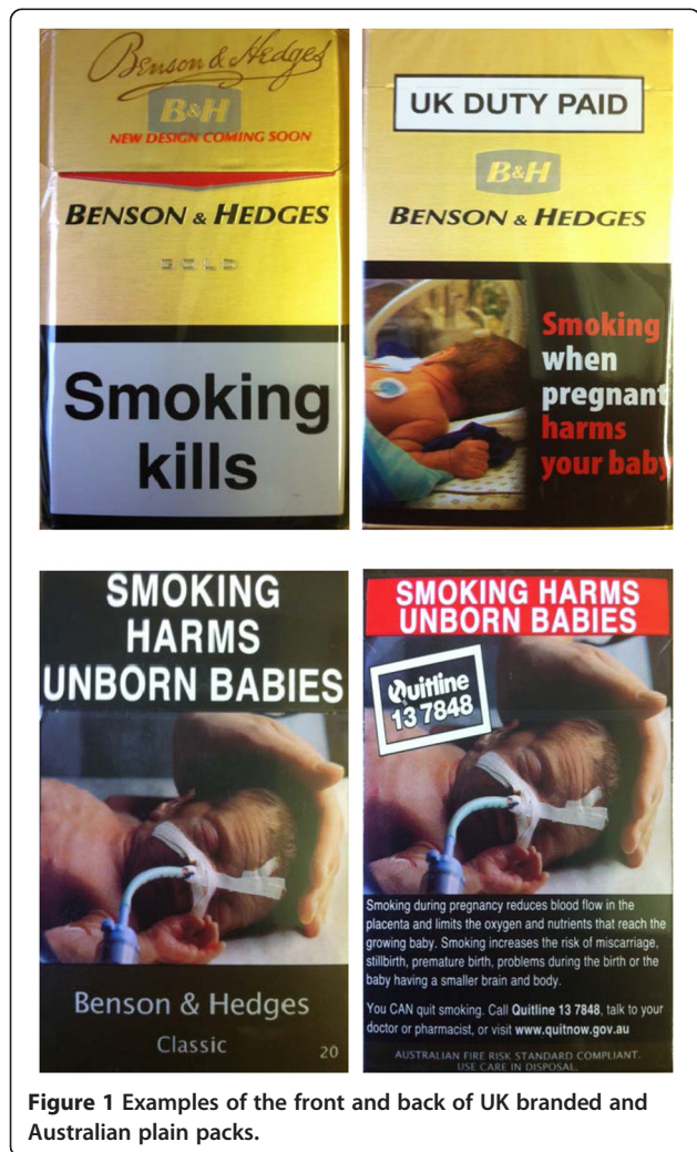
Figure 1 Examples of the front and back of UK branded and Australian plain packs.