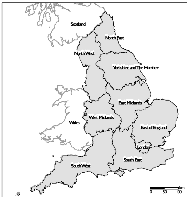
Figure 1: A map of England showing the Government Office Regions (GORs)

the home, ethnicity, work limiting illness, car ownership, dog ownership; and c) temporal data on the season and year of data collection. OR = Odds Ratio. CI = Confidence Interval. * p < .05 ; ** p < .01 , *** p < .001 .