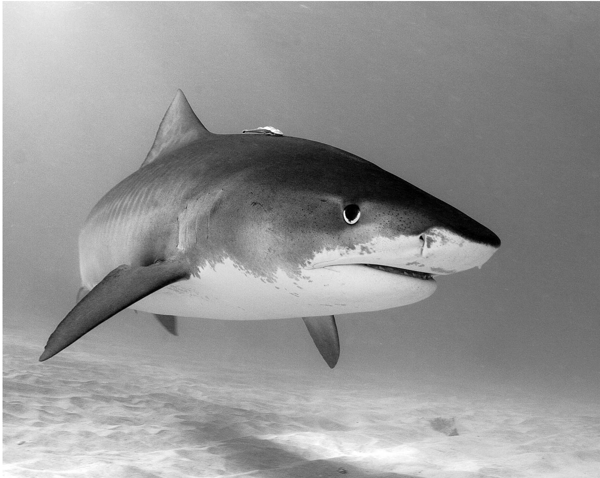
PLATE 1. The tiger shark ( Galeocerdo cuvier ) is a wide-ranging apex predator distributed across temperate and tropical seas. Tiger sharks possess behavioral and anatomical specializations for hunting sea turtles. The top surface of the shark is darkly pigmented which also allows them to maintain camouflage when hunting turtles resting at the water surface. This study used long-term satellite tagging data from large tiger sharks and adult female loggerhead sea turtles ( Caretta caretta ) to examine their movements relative to one another and evaluate if turtles modify their behaviors to reduce their chances of shark attack. The results show that turtles do not alter surfacing behavior to risk avoidance but that sharks may modify their behavior in an effort to increase their chance to prey on surfacing turtles.

Hawkes et al. 2011). Increased foraging activity may lead to higher daily activity costs and thus to an increased need to surface to breathe. Increased surfacing during the summer may be further related to migration using landmarks or even a solar compass for navigation (e.g., Avens and Lohmann 2003, 2004). Turtles could also be surfacing more in the summer to enhance foraging opportunities by detecting food availability through odor cues (Endres et al. 2009). Thus, summer behaviors probably render the loggerhead turtles more vulnerable to tiger sharks due to their conspicuous activity and because neither species is constrained by temperature (Brown et al. 1999). In a similar manner, predatory water pythons ( Liasis fuscus ) migrate seasonally to feed on dusky rats ( Rattus colletti ) in Northern Australia (Madsen and Shine 1996). During the dry season, the rats live in soil crevices in the floodplain, where conditions allow them to co-occur and snakes