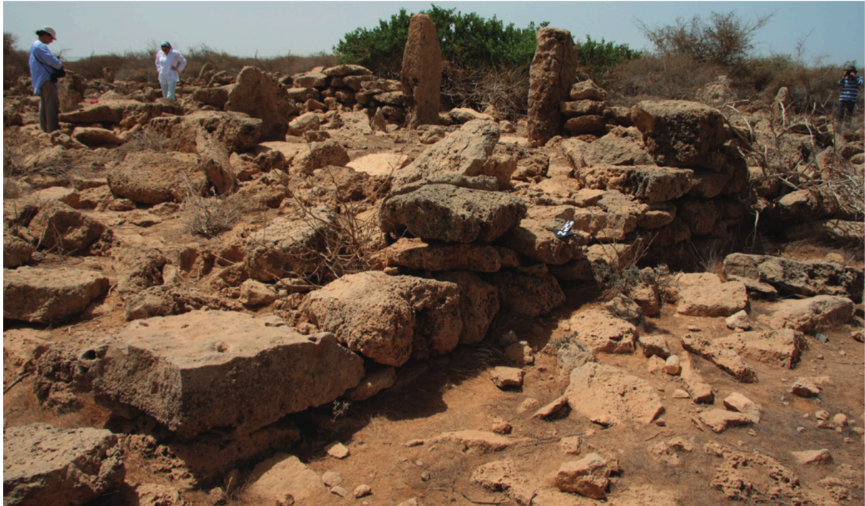
Figure 3. A general view of the Wadi Matar Bā' site, on which the anchor was found.

suggest that it has been shaped from a flat slab, the sides being cut using a metal implement. No tool marks were visible on the top surface. The holes themselves appeared to have been carved through in one direction from one side to the other, using a metal chisel.