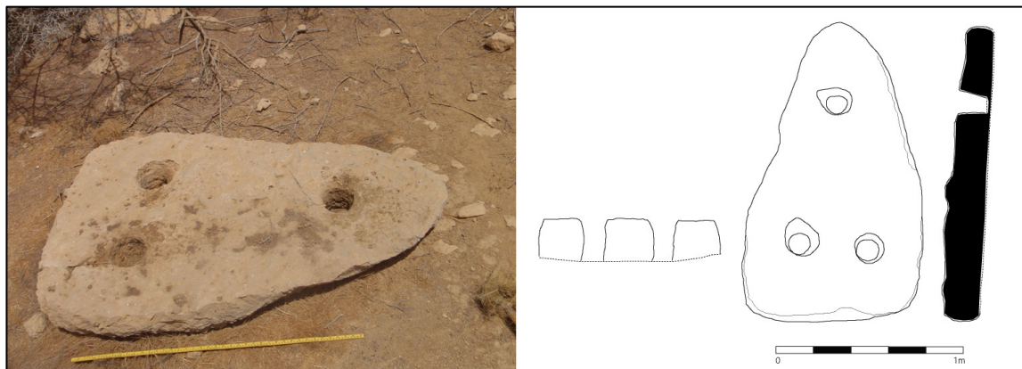
Figure 2. The Wadi Matar stone anchor. The scale in the photograph is 1 m. (The authors; drawing assisted by Lucy Semaan)