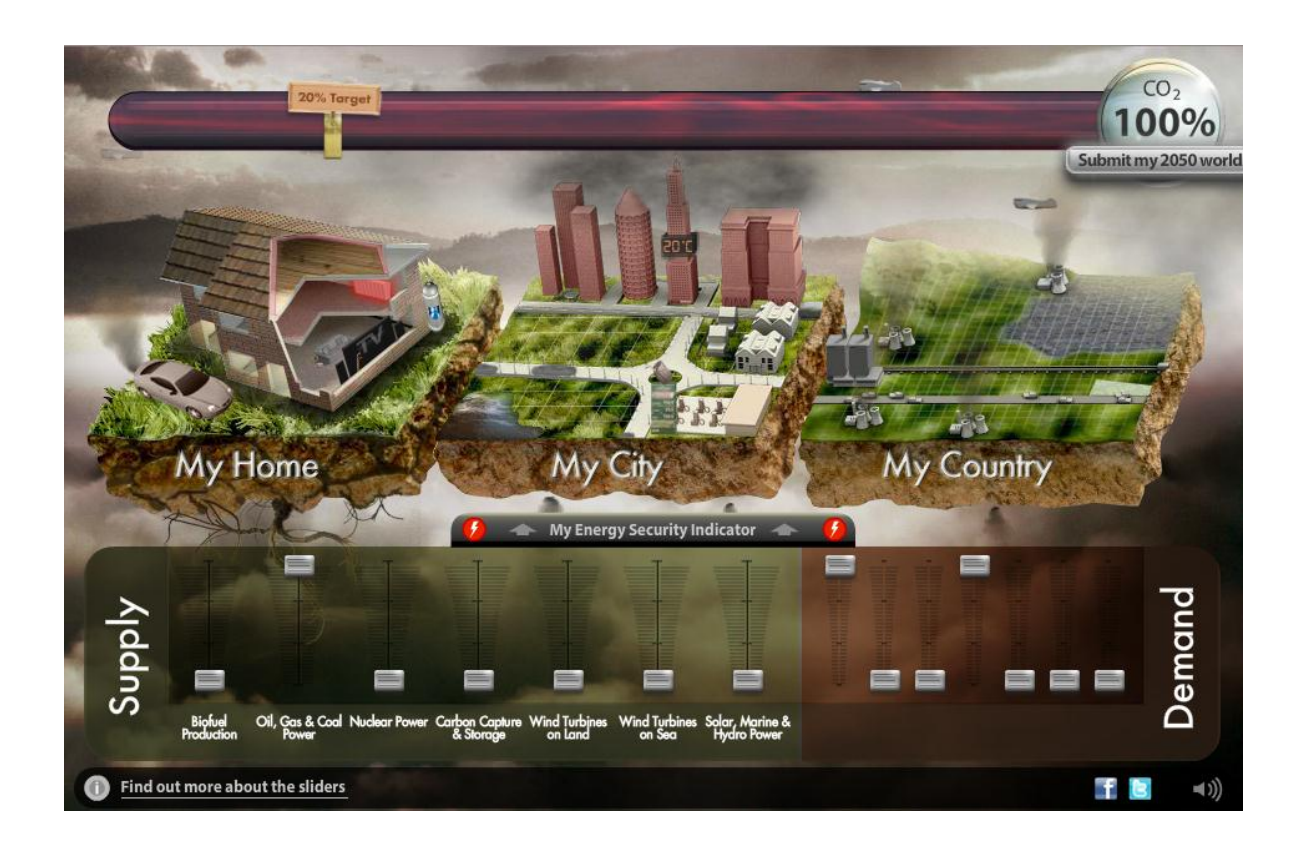
FIGURE 2: The my2050 Scenario Building Tool illustrating the 7 'supply side' sliders (contains public sector information licensed under the UK's Open Government Licence v2.0)

The my2050 tool represents a simplified version of a detailed 2050 energy system calculator(34) for the UK, also developed by DECC. Piloting had shown that many members of the general public did not find the overly technical graphs, language and operation of the full calculator engaging. The my2050 tool that we eventually adopted (available online at my2050.decc.gov.uk)