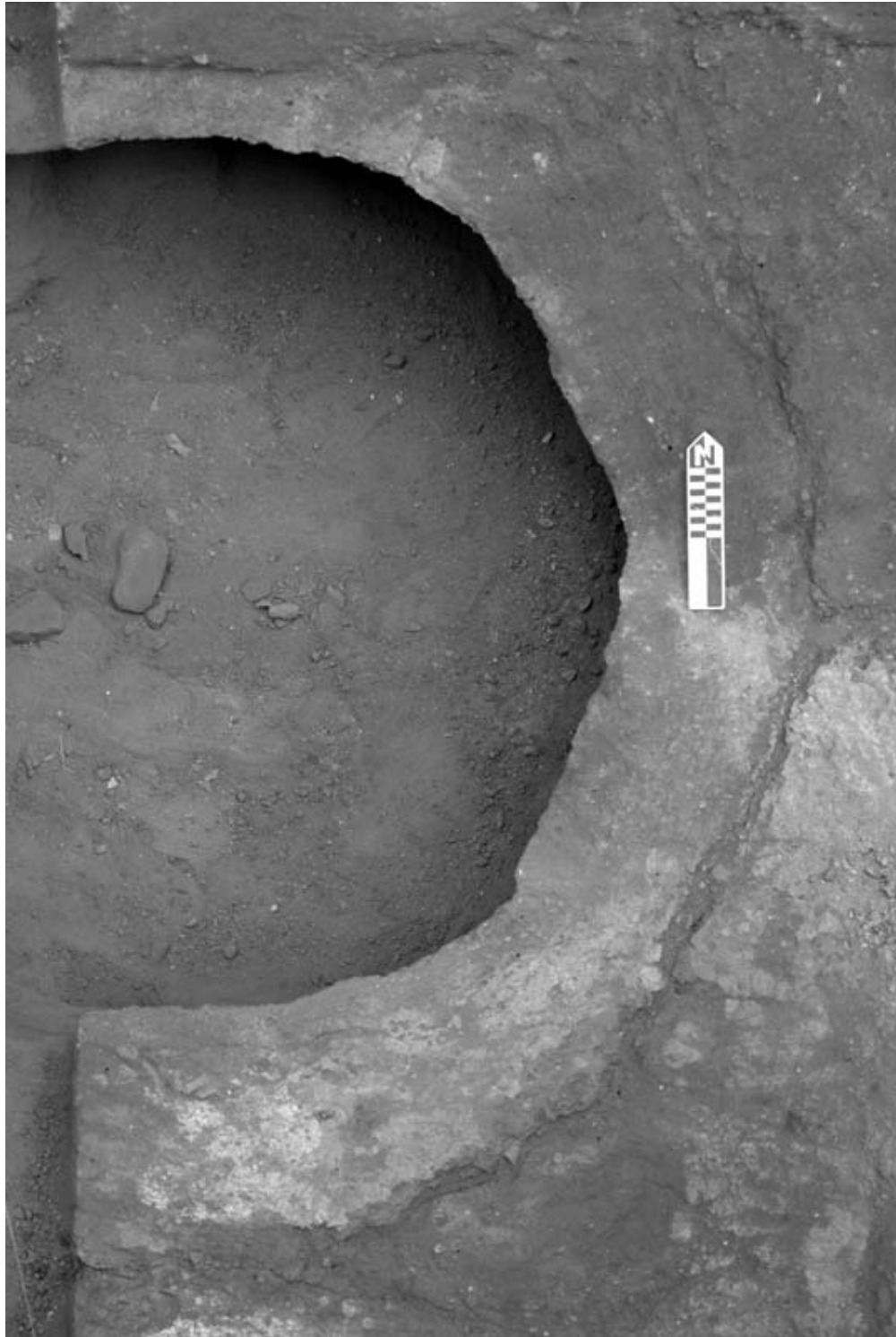
Figure 7 A desiccation crack that follows the edge of a cache pit feature at the Mitchell site.