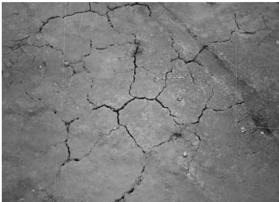
Figure 5 A complex network of desiccation cracks on an unexcavated portion of the Archeodome floor. The chaining pin is 35 cm long.