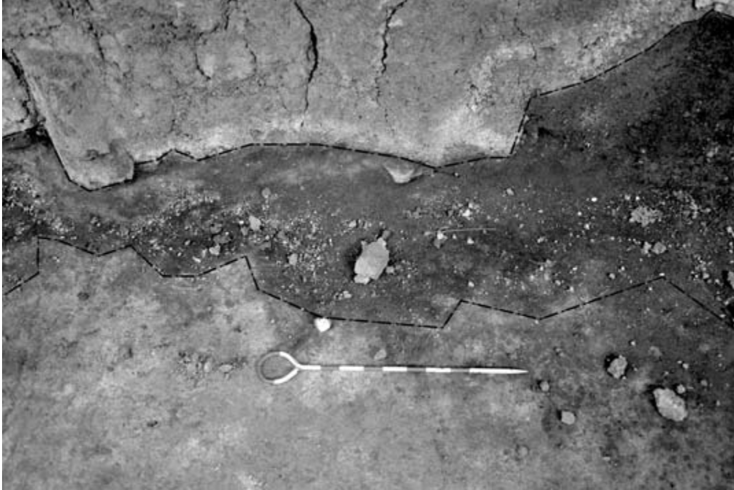
Figure 11 Mold growth in excavated areas where water has infiltrated beneath the walls of the Archeodome. The chaining pin is 35 cm long.