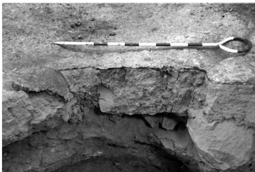
Figure 10 The upper rim of a cache pit that has partially collapsed. Dried and hardened soils contribute to these events of collapse, and make it difficult to preserve certain features for public viewing over extended periods of time. The chaining pin is 35 cm long.