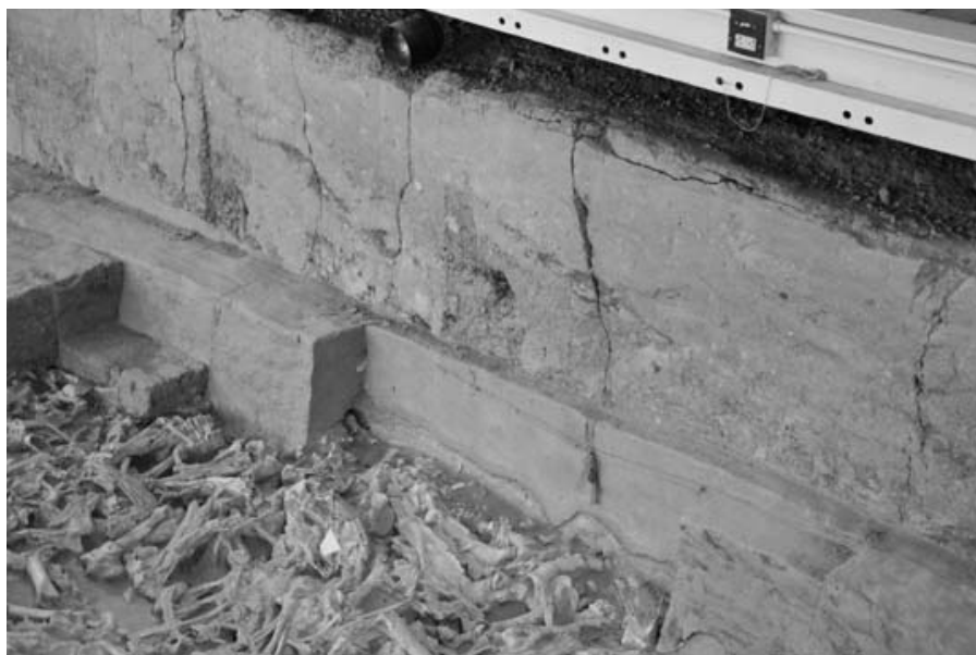
Figure 6 Desiccation cracking of fill soils inside the structure at the Hudson Meng bison kill, Sioux County, Nebraska. Note that desiccation cracking affects the recent fill soils that cover early deposits, but do not affect the early Holocene bone-bearing level.