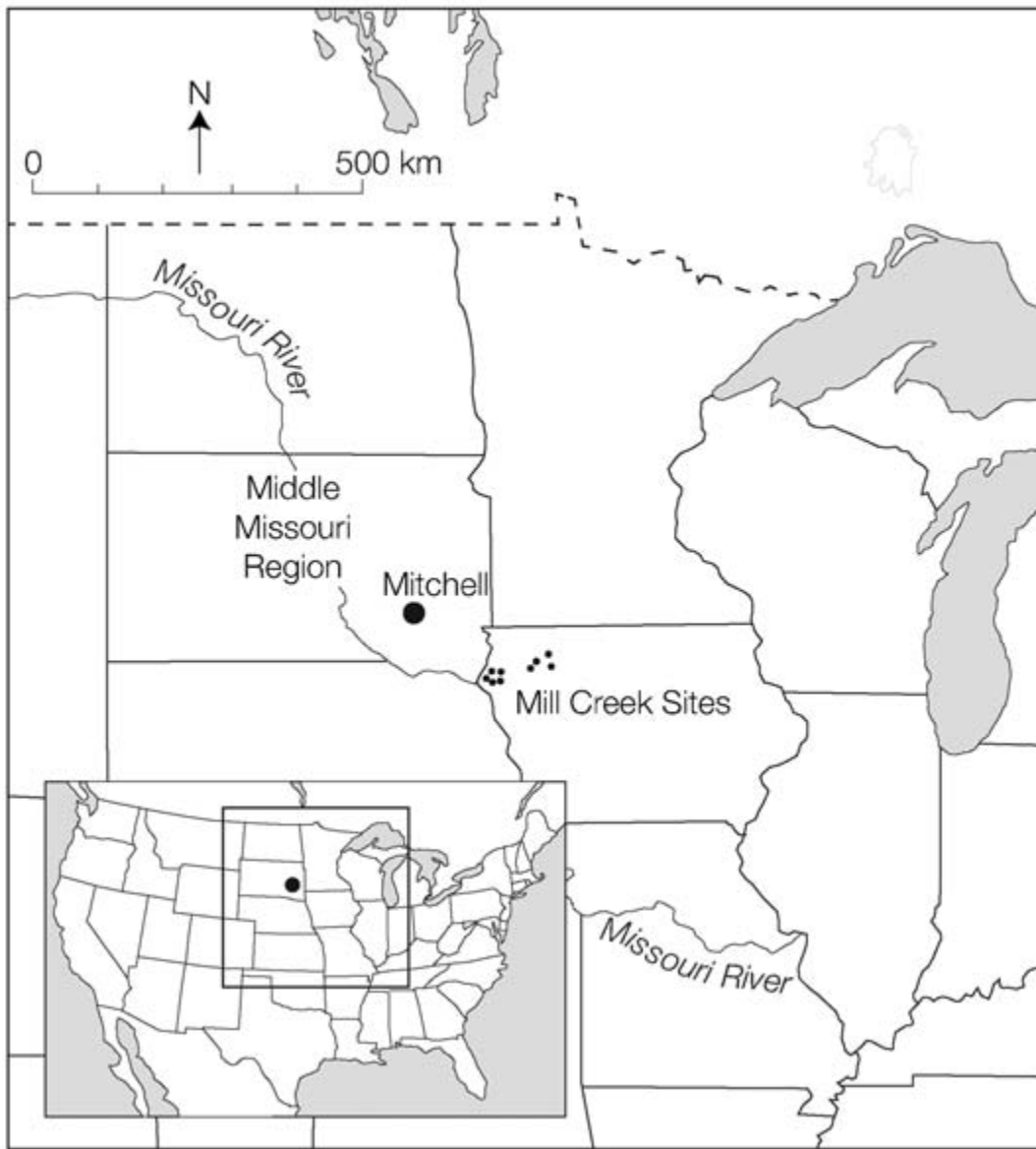
Figure 1 Map indicating the location of the Mitchell site relative to other similar sites on the Northern Plains.