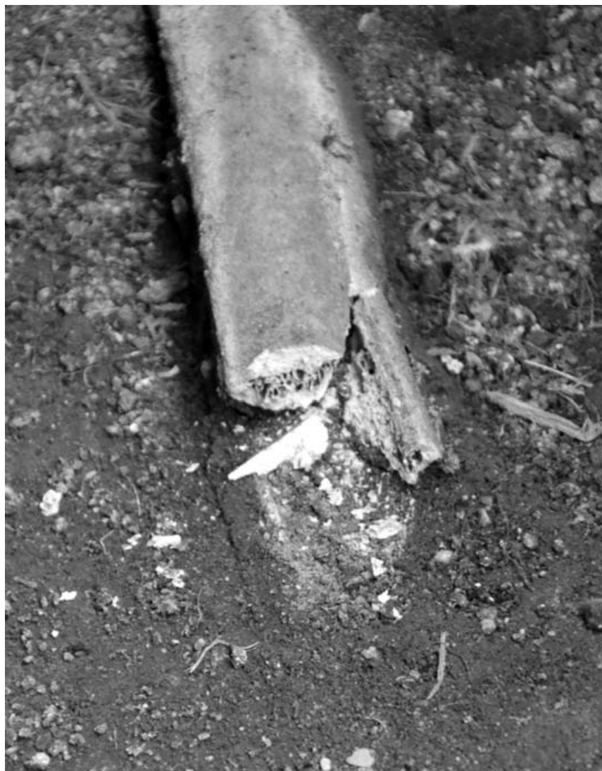
Figure 8 One example of a bone fragment that exhibits a “new” fracture surface, (or a fracture that has formed as a result of excavation rather than cultural or taphonomic processes). The clean, white fracture surface suggests that the bone was fractured shortly before it was liberated from its depositional environment, in part as a result of the severely dried and hardened soil at the site, or repeated episodes of wetting and drying.