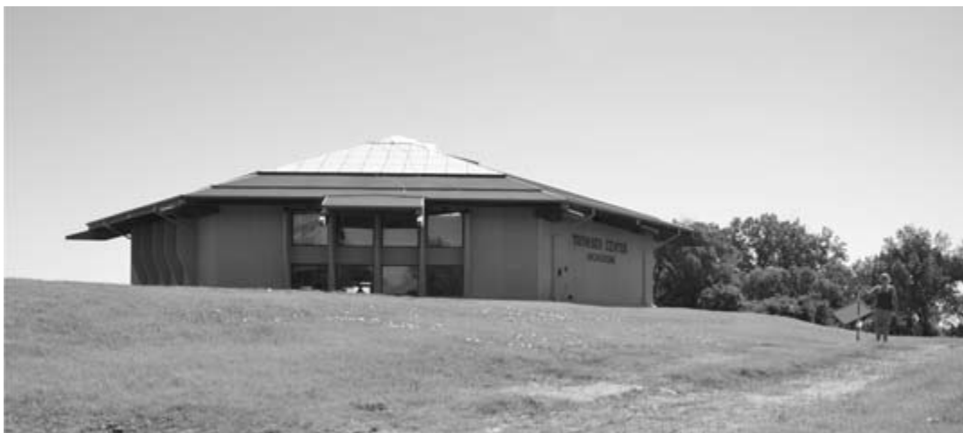
Figure 3 The “Archeodome” at the Mitchell site. The berm in the foreground allows the conveyance of water, sewage, and electrical lines to the Archeodome structure (discussed later in this article). The student in the photo is 1.66 m tall.