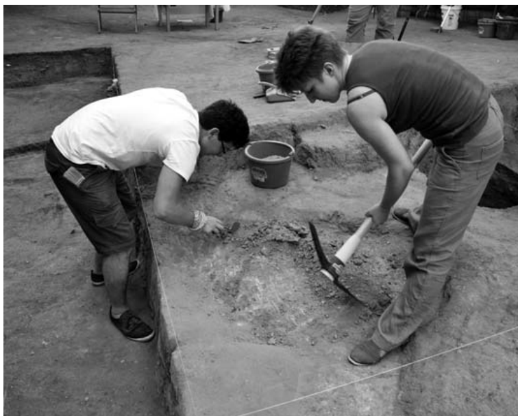
Figure 9 A mattock in use at the Mitchell site. While outdoor soils are relatively soft and easily excavated, some indoor soil matrices are so severely dried and hardened that their effective excavation with a trowel is made nearly impossible.