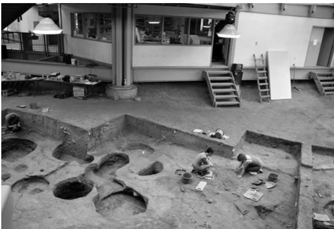
Figure 4 Artifact processing laboratory as seen from above the excavation floor. Artifact processing and archaeological interpretation and analysis take place within sight of ongoing excavation.