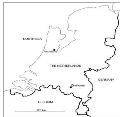
Fig. 1: Map showing the location of Eindhoven in The Netherlands.

In addition to the above, a pre-requisite of PREPARED is to develop, in partnership with 'demonstration cities' (including city officials and water companies), methods and applications to assess risk-reduction measures. Therefore, our approach not only satisfies the needs of the city, but also the requirements of the project, i.e., the use of existing models, the active participation of the local stakeholders, and the demonstration of a methodological approach, which would be applicable to other similar case studies. The next sections describe in more detail the approach adopted, and present some results.