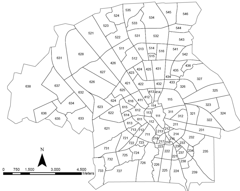
Fig. 3: The Emmovent city zones analysed.