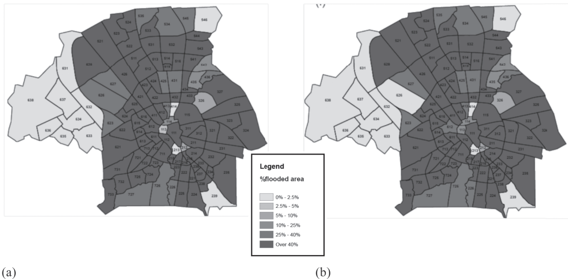
Fig. 4: Percentage of city zones flooded for (a) the 10-year baseline and; (b) the 10-year disconnection scenarios

to 76% and number of properties flooded was reduced to 59% (Table 2). So, although the overall figures do not vary considerably for the city as a whole, they are significant for localised flooding, in specific areas.