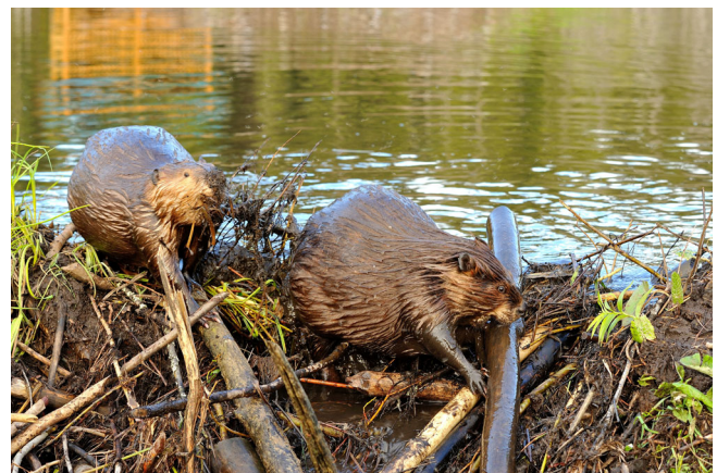
FIGURE 3 Two beavers ( Castor canadensis ) plugging holes in their dam with sticks and mud. This keeps the water level high. The sophisticated technological behaviors of beavers are assumed to be under genetic control while involving much learning and decision making at the same time. [Color figure can be viewed at wileyonlinelibrary.com ]

An analogous scenario can be considered, hypothetically, for the intriguing mix of similarity and difference in Acheulean stone tool manufacture. This research on bird nest building suggests how difficult it may be to disentangle the mix of learned elements, innate elements, and the effects of ecological, functional and other constraints—a mix which includes aesthetic preferences 7 as well as