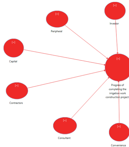
Fig. 1. Research model

Based on studies that have been done in the past, combined with factors that affect the success of the project. The author proposes 06 hypotheses with observed variables in 06 groups of factors affecting the progress of completing irrigation projects using State budget capital. The observed variables are also a prerequisite for establishing a questionnaire to identify factors influencing changes in the progress of completing the construction of irrigation works using State budget funds in Thai Binh province. The questionnaire will be sent to all stakeholders in several public investment projects in Thai Binh province. The author uses the 5-level Likert scale in the survey questionnaire, the Likert scale is the most used measure in socio-economic research and is evaluated according to 5 specific levels such as: