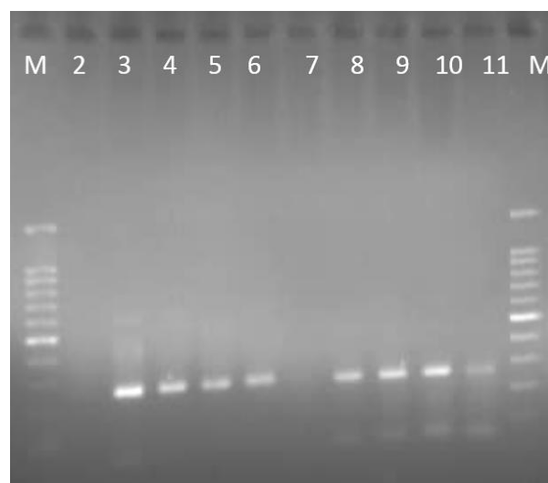
Fig. 1: Agarose gel electrophoresis of PCR amplification of the 261-bp target fragment from T. vaginalis isolates. Lane M: DNA marker (100 bp); Lane 2 & 3: negative & positive control; Lane 4-6 & 8-11: positive samples; Lane 7: negative sample

T. vaginalis infection was diagnosed in 10 of 214 male participants (4.7%, 95% CI: 7.5-1.8%) using the PCR assay (Fig. 1).