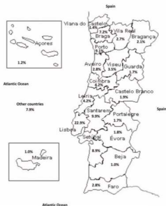
Figure 1 Cadets' district of birth (%) – 2016