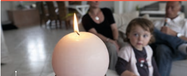
Combustion deodorizers contribute to indoor air pollution

Head of the Indoor Air Quality Observatory (OQAI) in the Health & Comfort directorate of the Scientific and Technical Center for Building (CSTB) in France