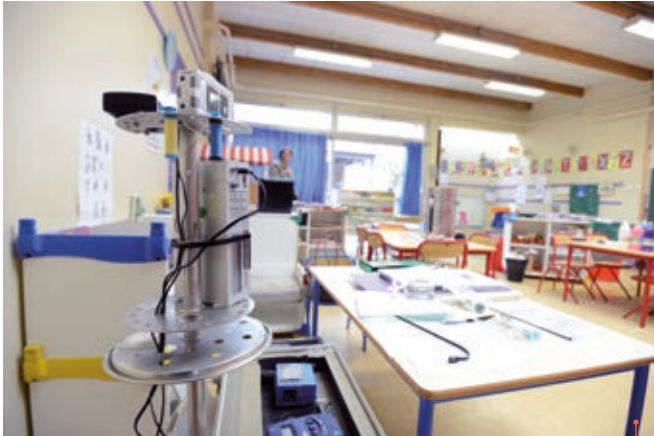
Indoor air quality measurement in a classroom