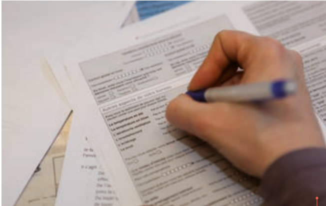
Investigation of the links between the perception of air quality, comfort and health effects in indoor environments

throat (21%). 7 The ability to control the indoor environment (temperature, lighting, etc.) promoted a more favorable perception of it. Similarly, the existence and effectiveness of a complaint management procedure is associated with a more favorable perception of air quality and comfort, and with a reduction in perceived health effects noted inside and attributed to the building.