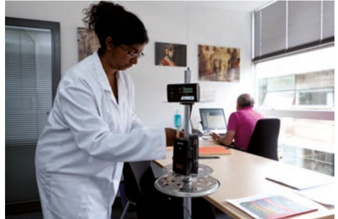
Indoor air quality measurement in a workplace

With statutory indoor air quality monitoring in place in nurseries and schools, the next step is to prepare for subsequent deadlines and identify the relevant parameters for monitoring other spaces open to the public. To this end, the public authorities have commissioned the OQAI to perform surveys in three types of establishments specifically targeted for the 2023 deadline: accommodation for senior citizens, and long-term care units and centers for disabled children and adults. Approximately 100 randomly selected establishments are currently being studied (2019-2020) to obtain preliminary data on indoor air quality and comfort in these spaces.