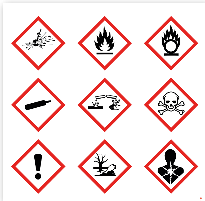
Hazard pictograms on chemical products

The large-scale observation of occupied building stock is a unique tool for developing and adjusting government policies, motivating professionals and raising awareness among the general public