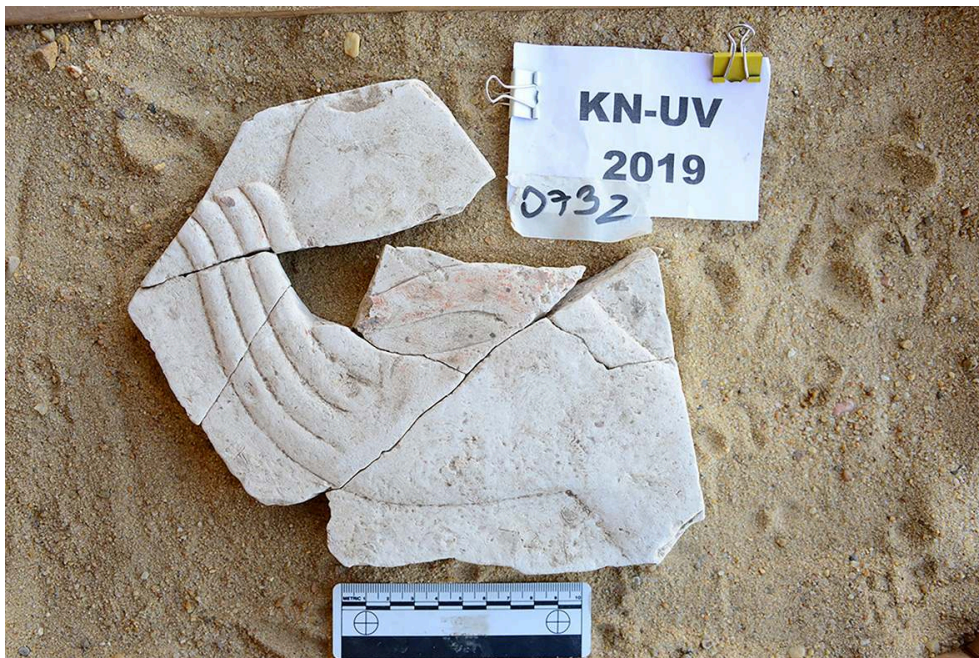
Fig. 2. Relief fragment KNUV-732 (photo no.2019-P2055. K. Hutter)