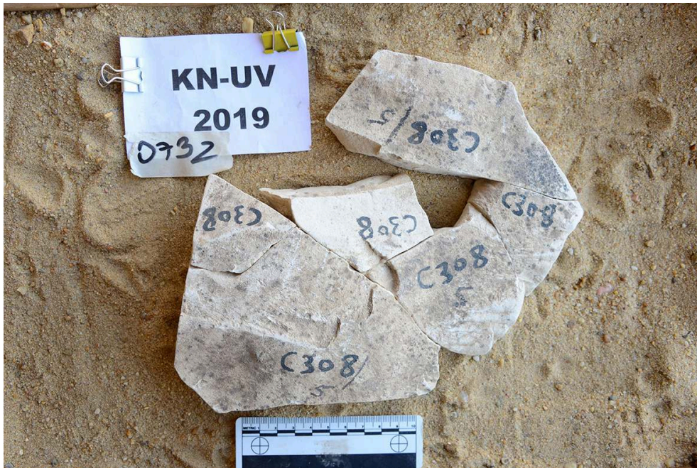
Fig. 3. Back view of relief fragment KNUV-732 (photo no.2019-P2056. K. Hutter).