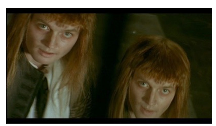
from Wojciech Has' Memoirs of a Sinner

The filmic idea of the trio operates as soon as the "scene of the mirror" (the very first confrontation between Robert and his Doppelgänger ) occurs. In this vision, the complex set of mirrors actually shows