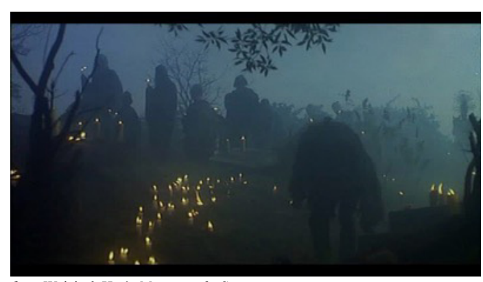
from Wojciech Has's Memoirs of a Sinner

a collective alienation, folkloric superstition, and popular representations reversing the pastor and the devil. This reading is in line with recent interpretations of the Gothic as a reaction of fear provoked by the French Revolution and the terror. The political dimension of Wojciech Has' Memoirs of a Sinner , if unclear to most of the spectators, still leaves open some space for discussion, especially if linked to other Polish filmmakers who have filmed stories of possession (Jerzy Kawalerowicz's Mother Joan of Angels , 1961), the devil (Andrzej Zulawski's The Devil , 1972), and Doppelgängers (Krzysztof Kieslowski's The Double Life of Véronique , 1991).