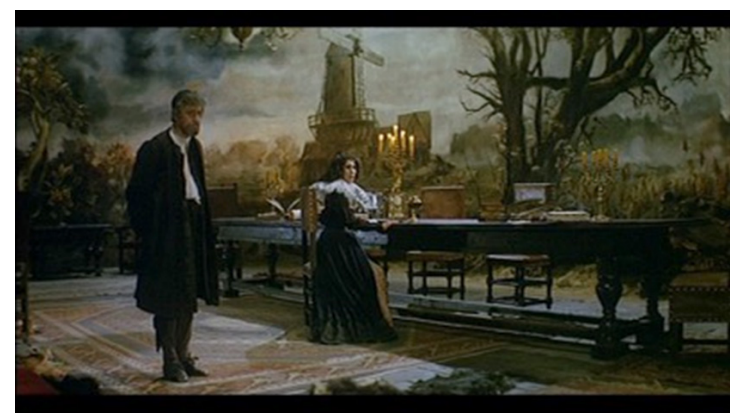
from Wojciech Has's Memoirs of a Sinner

Even the rare "urban" scenes – located in the tavern and in one dark street – are composed like a series of Dutch or Flemish genre paintings– or even Bamboccianti – typical subjects of countryside life and lower classes: men drinking and playing, prostitutes, beggars, fights. Always filmed in the dark, these scenes are meant to be opposed to the representations of the countryside as a Virgilian bucolic universe. Robert's dark