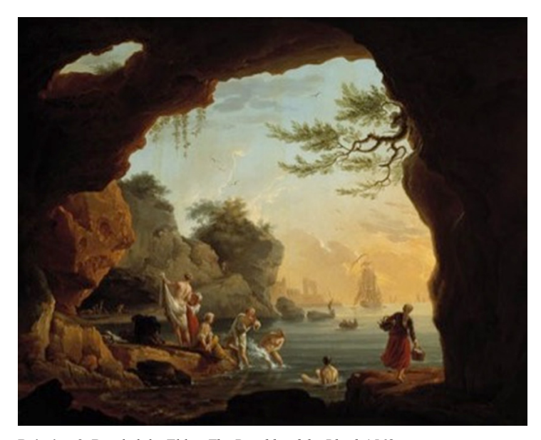
Painting 2. Brughel the Elder, The Parable of the Blind , 1568

This "re-indigenization" first emerges with the countryside representations set without temporal connotations. With sequences of outdoor feasts and tracking shots showing peasants working in the fields, with Robert marching with a stick like as shepherd or a pilgrim at the end of the film, background multiplies references to an imaginary that represents a happy, innocent and domesticated relationship between men and their environment.