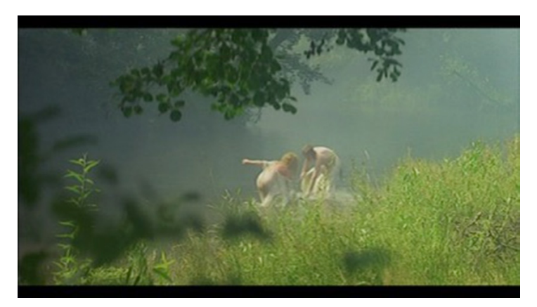
Painting 1. Vernet, Les Baigneuses, 1759