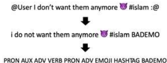
Figure 1: PoS Tagging example

URLs to the vocabulary. In this way we have injected some parts of the speech of the social media language into a standard PoS Tagging model. We were definitely aware that tweet oriented models such as UDPipe tool (Straka, 2018) trained on POSTWITA-UD Treebank (Sanguinetti et al., 2018) would have performed better than our solution on the in-domain data but our solution guaranteed a more balanced performance. An example of our PoS Tagging is showed in Figure 1.