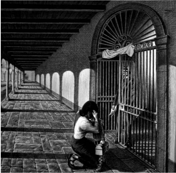
IMAGE 9 – “A entrada”, charcoal drawing (Collection Quadros do Pinho)