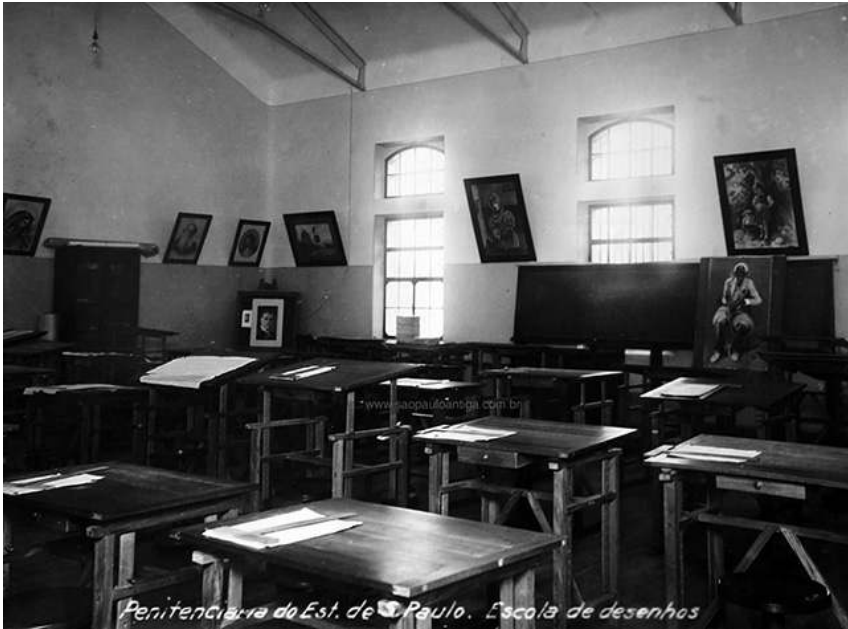
IMAGE 6 – São Paulo State Penitentiary, Drawing School (paintings)

The work is signed by C. Lourenço, inmate number 426. This is the information available. 19 The painting is on display at the Paulista Penitentiary Museum. It is the result of the painting workshops of the São Paulo Penitentiary, and it was painted in the 1920s. It is possible to see the work in two photographs of the Drawing School (see Images 6 and 7).