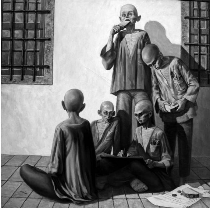
IMAGE 8 – “A venda da ração de pão”, oil painting (Collection Quadros do Pinho)

The paintings signed by Pinho are in the Archive and Museum Centre of the Directorate-General of Reintegration and Prison Services in Lisbon. There are 20 paintings 20 that deal with life in confinement, showing the bars, the guards, the uniforms, the shaved heads, the refectory, the suffering, the punishment, the myriad institutional practices (see Images 8 and 9).