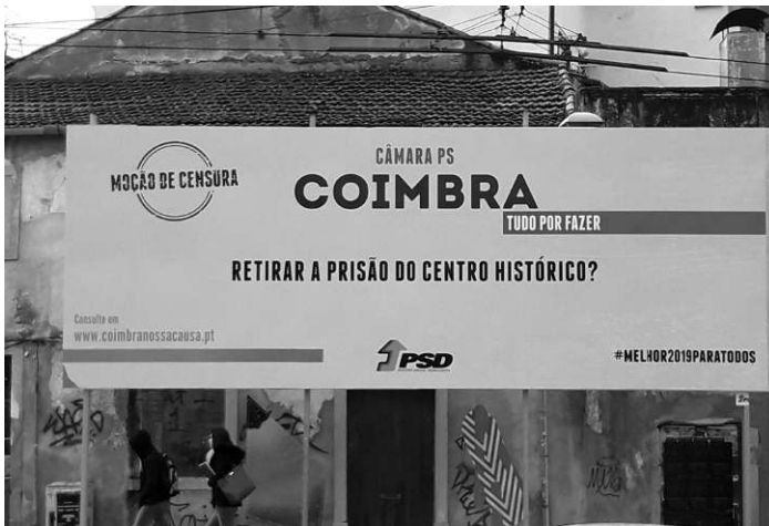
IMAGE 4 – Billboard “Remove the Prison from the Historic City Center?”

The process of classification of the property, which makes it a monument of public interest, 14 makes no mention of the painted cell, meaning it might potentially not be included in any efforts to preserve graffiti or murals in the face of new proposals for use of the prison space, constantly rethought and poorly defined. 15 In early 2019, a billboard placed in front of the Penitentiary by the Social Democratic Party (while the City Council was governed by the Socialist Party) brought up the question: “Remove the prison from the historic city center?” (see Image 4).