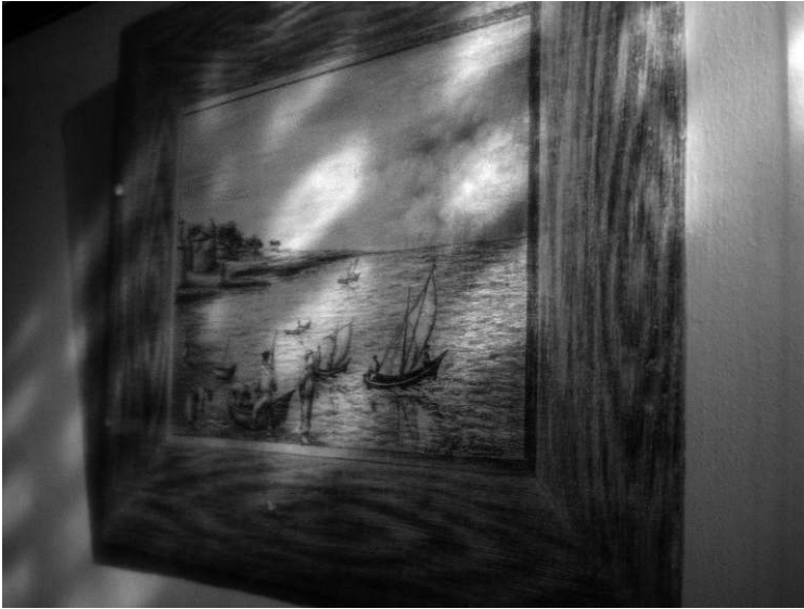
IMAGE 2 – Cell (detail), Coimbra Penitentiary