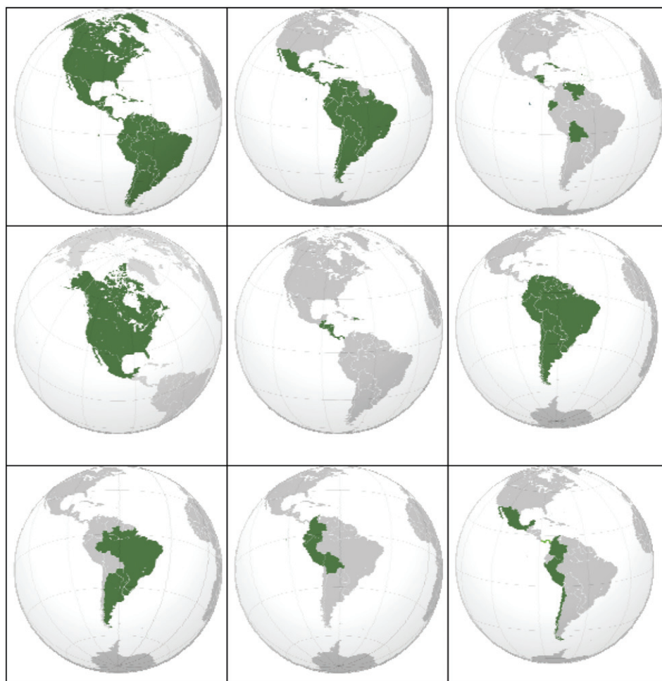
FIGURE 2. Latin America: decentralised regionalisms

From top left, reading wise: (1) the Americas, (2) Latin America, (3) ALBA, (4) North America (NAFTA), (5) Central America (SICA), (6) South America (UNASUR), (7) Mercosur, (8) Andean Community, and (9) Pacific Alliance.