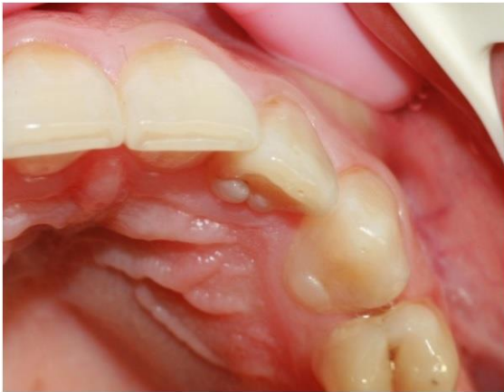
Figure 1: The protuberated gingulum in the palatal aspect of the left maxillary lateral incisor

palpation, and tenderness to percussion was mild.