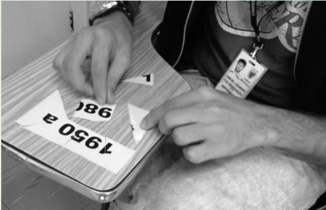
Image II - Construction of the puzzle to the second historical period established (1950 to 1980). São Paulo, 2013.

After, participants were advised to proceed to the next activity in search of materials into "time capsule" pertinent to the historical period identified in the puzzle and start building your Panel.