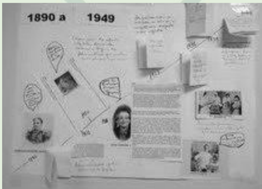
Image IV - Interactive Panel representative of the period of 1890 to 1949- Timeline on the history of education in Nursing Administration. São Paulo, 2013.

Upon completion of the task, participants were encouraged to presentation and discussion of their products. The results were socialized from the creation of frames in the timeline, and there have been significant changes and highlight important historical landmarks of the teaching of nursing administration.