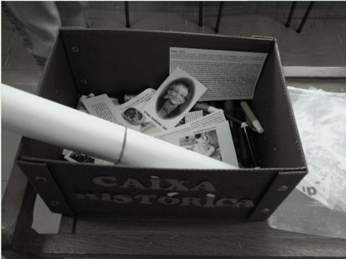
Image 1 -Historical Box of materials used in the development of the strategy. São Paulo, 2013.