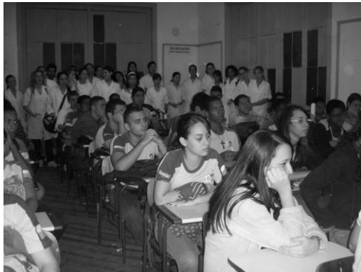
Image 3 - From another angle, students of the 3 rd High School grade from the Olinto School. At the background, Nursing Academics from the UNIRIO