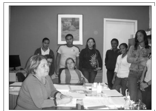
Image 1 - Presentation on the University and the EEAP, at the EEAP's Principal Room

We have highlighted some images that represent the three meetings for having a general idea.