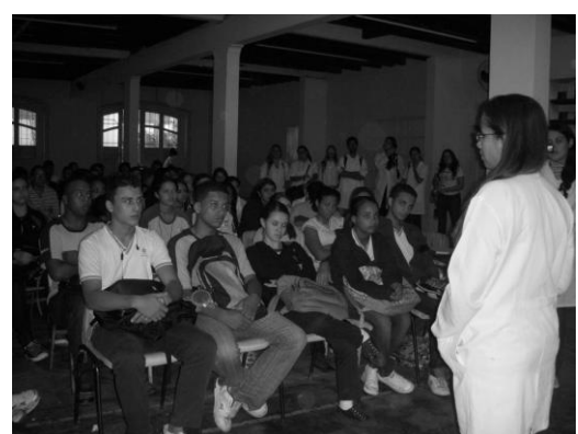
Image 2 - Academic of the 3 rd term of the Undergraduate Nursing Course aware of the asking that is being conducted by the student of the 3 rd High School grade.