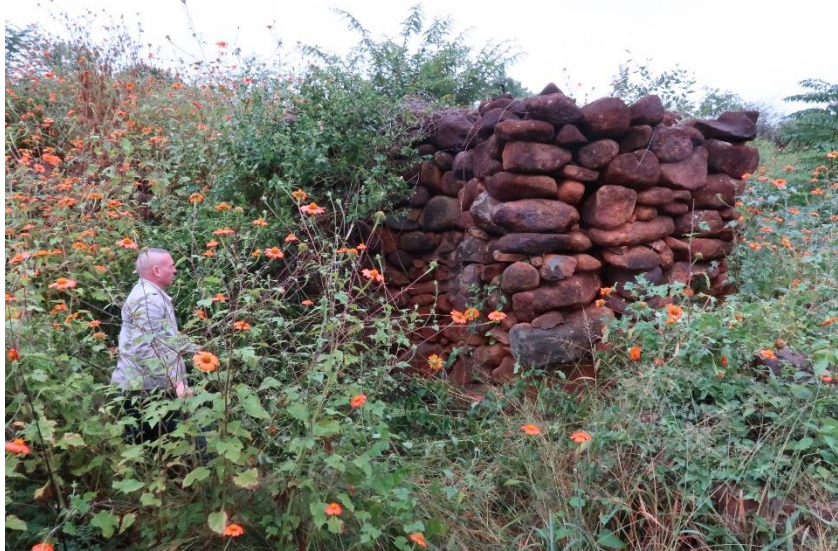
Figure 8: New Jerusalem at Mbhokota (2019).