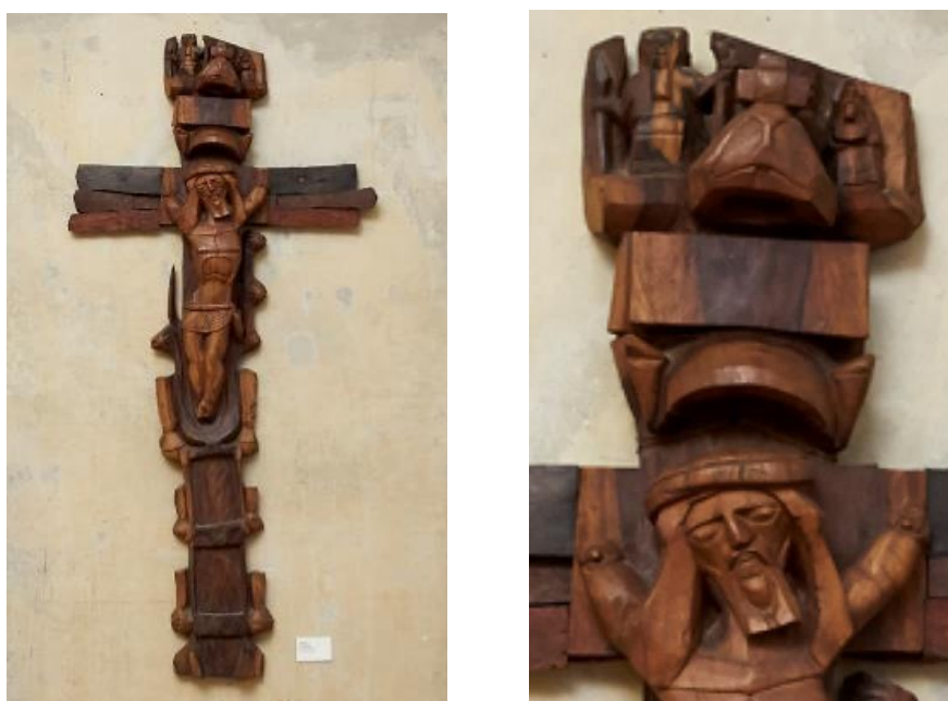
Figure 2: left: Crucifix (IV) , right: detail.

Some of the first carved sculptures to emerge from the 1960s are Hlungwani's Crucifixes (Becker, 1989: 23). The faces of Christ on the Crucifixes (I-IV) are possibly self-portraits of Hlungwani ( Figure 2 ), thereby asserting his closeness to the subject-matter by personalising Christ's suffering with his own suffering, as he had undergone "a spiritual as well as physical metamorphosis" (Maluleke, 1991: 20). Hlungwani-Christ is depicted with long hair and a beard, and the expected traditional crown of thorns is replaced, according to Becker (1989: 22), with a Tsonga head-ring, symbolising "maturity, wisdom and leadership". Based on closer observation, I believe that the crown of thorns is accompanied by the sculptor's own Rastafarian-coloured cap (Maluleke, 1991: 16), which is found immediately above the crown or Tsonga head-ring.