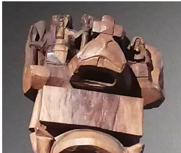
Figure 3: Detail of Crucifix IV : two nameless, bearded celestial figures on either side of a heavenly crown.

Nicolaides (2020: 4), “Moses symbolizes the dead and Elijah, given that he was carried up to heaven in a chariot of fire, represents the living.” Christ being crucified metaphorically fulfils the “law and the prophets”. Therefore, Crucifix IV depicts a victory over death rather than defeat – effectively a symbolic death and rebirth in Hlungwani’s life. Nicolaides (2020: 4) states that, “The Transfiguration brings to us a jubilant message, and a confirmation that God is indeed accessible to any personal experience.” I believe the reason for choosing these two figures is once again a reflection of Hlungwani’s closeness to God, “underlining his interaction between his two worlds: the one we live in, that is the concrete one, and the other one, associated with the metaphysical, the abstract” (Steyn, 2019: 186).