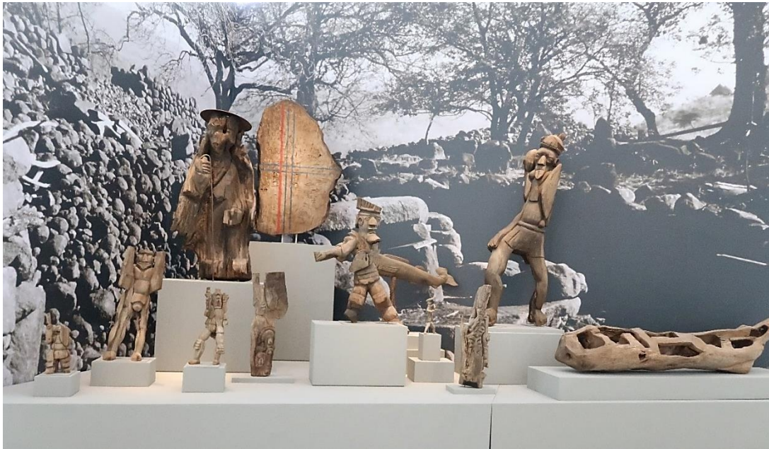
Figure 6: Altar of God .