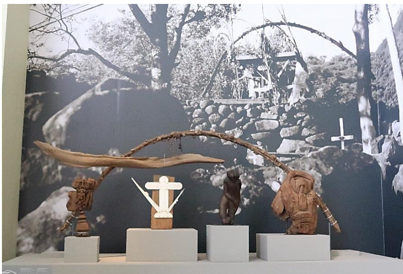
Figure 7: Altar of Christ .

The Altar of Christ ( Figure 7 ) is significantly smaller than the Altar of God with fewer sculptures on it in its original setting: Angel Gabriel (III) , Salmon Fish , Solar Arc , Metal Cross , Christ Playing Football , and God. Shaka's Shield , a large carved wooden shield with a reddish colour was originally part of this assemblage but is now lost. According to Leibhammer and Nel (Burroughs et al , forthcoming: 171), it was "Hlungwani's practice to preach from this altar, which served as a 'pulpit' with its curved bough or "arc" acting as a framing device."