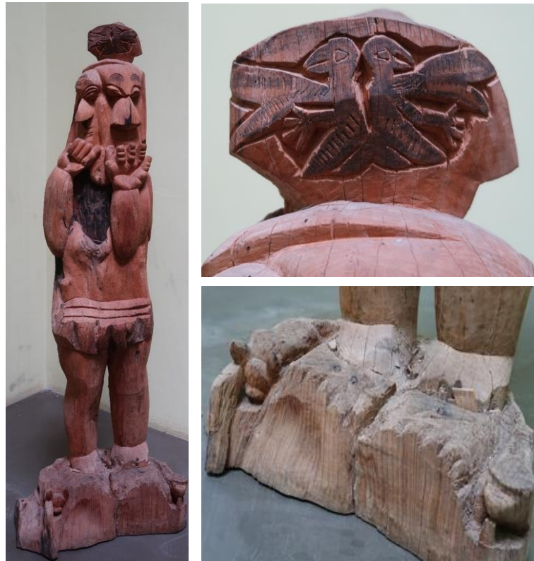
Figure 4: Left: God and Christ , top right: detail of double-headed bird, bottom right: detail of ox, bird, and lion.

The prophet Ezekiel must have been close to Hlungwani's heart as Ezekiel was God's prophet who criticized his people for their corruption and other sins. Hlungwani himself prophesied "the coming of an Apocalypse, which would result in man's salvation, an ultimate victory over evil" (Steyn, 2019: 182). Once there is peace, there will be a rural home- a "New Country home of God and Christ" – on an acropolis site overlooking Mbhokota village in Gazankulu" (Rich, 1989: 27). This, in Hlungwani's mind, is a place where God and Christ will dwell with people for eternity. This is also the reason why Hlungwani made two altars for the New Jerusalem site, an Altar of God and an Altar of Christ . According to Hlungwani, the old world "has come to an end in 1984", and the New World (or New Jerusalem) appeared in 1985, after "Satan has been thrown in the Pit" (Revelation 20:3; Schneider, 1989: 62) — ending with the vision of the Great White Throne of Judgment. In Chapter 21, in his vision John describes how the Glory of New Jerusalem comes down from Heaven to Earth.