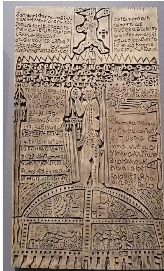
Figure 5: Wooden panel: Cain and Abel .