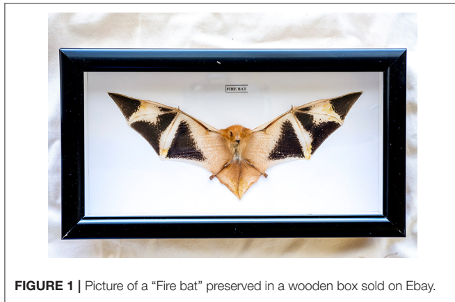
FIGURE 1 | Picture of a “Fire bat” preserved in a wooden box sold on Ebay.