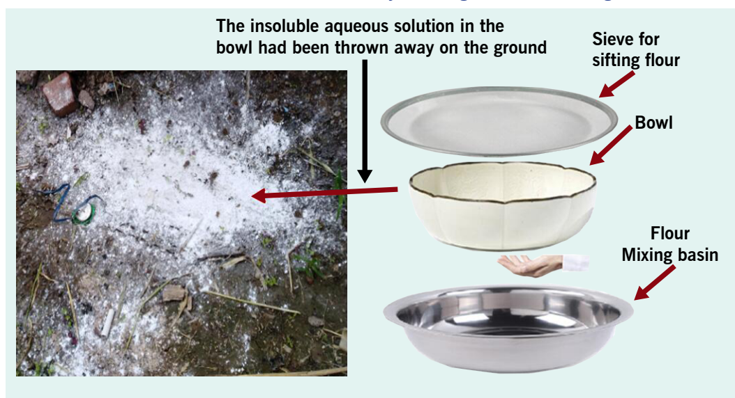
Fig. 2. The insoluble “starch” solution was thrown away on the ground after sifting